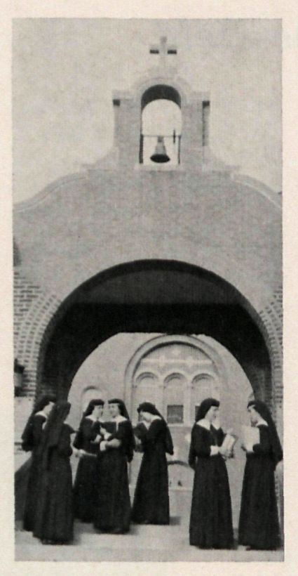
Informal discussions provide opportunities for mutual enrichment.

Religious communities of women are seeking to follow the mind of the Church by forming members capable of assuming