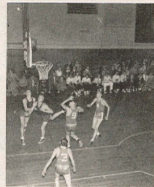
WHAT! THE BALLETT?