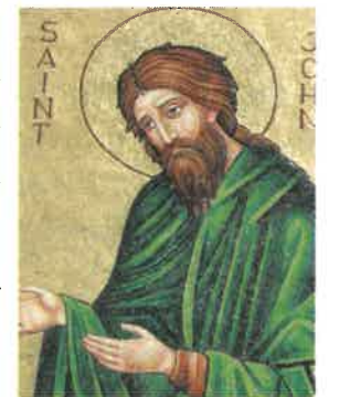
St. John the Baptist mosaic

The west-facing mosaics depict Christ, the Theotokos ("Mother of God"), St. John the Baptist, and St. George. Each mosaic is composed of thousands of pieces of colored glass.