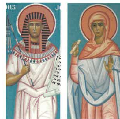
Above Patriarch Joseph (Genesis) and Righteous Hannah (I Samuel). Right: St. Mary Magdalene, Equal-to-the-Apostles, and St. Nicodemus the Secret Disciple (John 3).