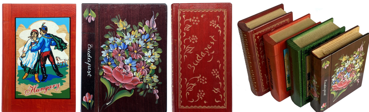
Figure 3. Range of typical Hungarian puzzle books

Note that these puzzle books are not really sold as puzzles, but more as souvenirs. You can get this puzzle in many different designs – some traditional, others beautifully decorated. In some puzzles the lock is better concealed than others. In one of the books the skew cut in the spine is concealed by a skew carving pattern on the spine, see Figure 2 right. This type of puzzle book was the first I purchased, several decades ago. At later visits to Budapest I purchased additional copies, see Figure 3. These puzzles have the size of a small pocket book (Height ~13 cm, Depth ~10 cm, Thickness ~3 cm).