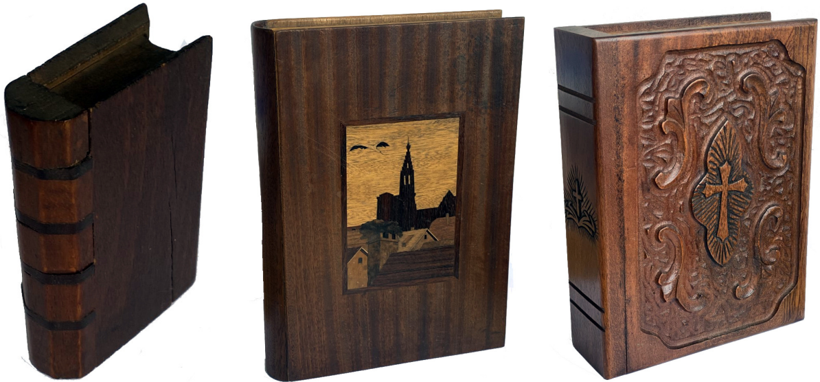
Figure 9. The smallest puzzle book I own is from Amsterdam (left), the biggest from France (middle), and the thickest from Cyprus (right)

This is the puzzle I found in Amsterdam in an antique shop with which I started this paper, see Figure 9 left. I got two identical copies. They are very small (HDT 8×5×2 cm). Interestingly the locking mechanism is one that I did not see before. As with most puzzle books, the locking mechanism is not difficult, but well-hidden.