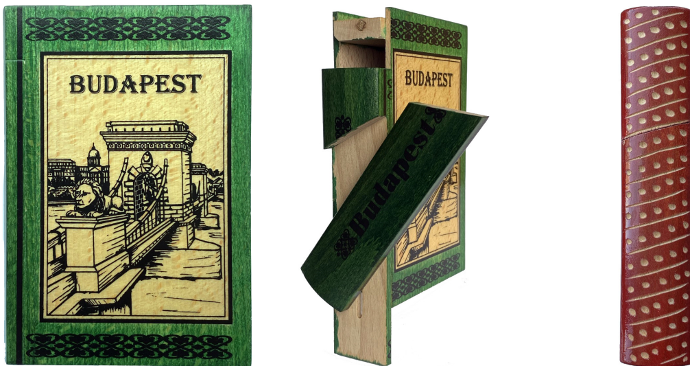
Figure 2. Hungarian puzzle book and its locking mechanism (left & middle), and concealing the skew cut in the spine by smart decoration (right)

If you visit Budapest, the capital of Hungary, and you wander into the Great Market Hall it is hard not to stumble on the first puzzle book presented here, see Figure 2. Also in souvenir shops throughout Budapest it is impossible for a puzzle collector not to notice these puzzles (unless you are fully focused on the other well-known puzzle from Budapest, a Sorrento-type puzzle box, which is even more dominantly available in all sorts and sizes). This puzzle book has a simple well-known opening, which is discussed in a book by Jack Botermans and Jerry Slocum [1]. The opening is in the spine of the book and can easily be recognized by a skew cut through the spine, see Figure 2. This lock is well-known, so I do not feel I give away anything.