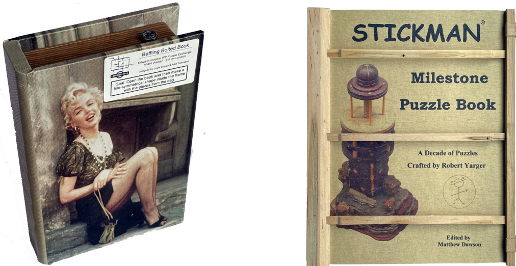
Figure 10. IPP34 Exchange puzzle from Allard Walker (left), book in puzzle lock from Robert Yarger (right)

The second puzzle book is more a puzzle than a puzzle book. It looks like a book but is a sequential discovery box. After opening the book, which requires the largest number of steps of all presented puzzle books, there is a small storage area which contains a small puzzle. The book is designed by Louis Coolen and Adin Townsend, and exchanged at IPP34 in London in 2014 by Allard Walker, see Figure 10.