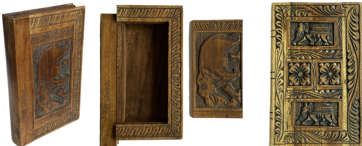
Figure 6. Books from Sri Lanka; simple (left/middle), more complex (right)