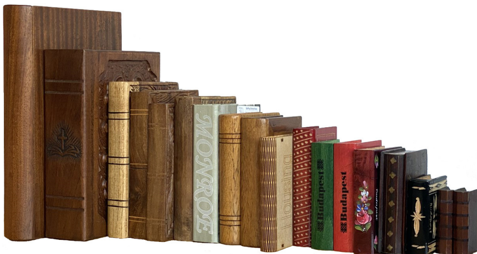
Figure 1. Puzzle books presented in this paper, showing the range of sizes

I intended to write this article for the postponed G4G14 in April 2021, but it was postponed two more times. In the meantime, I have been collecting more puzzle books. And on the way to G4G14 I visited the Lilly Library in Bloomington (IN) to look at the puzzle books in the Slocum Collection. In this article I am presenting 14 puzzle books in my possession that differ by their locking mechanism and/or their country of origin. Figure 1 shows the row of puzzle books presented. One puzzle is not included here because it would not fit (number 3). That —knowing one is not included— the number is bigger than 14 is because I have several copies of some puzzle books. Those copies look different but have the same origin/locking mechanism.