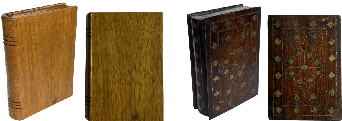
Figure 8. Two books with a well-hidden lock; English (left) and Indian (right)

The third puzzle book is a small Anglo-Indian puzzle book, made from teak wood with brass inlays, see Figure 8 right. As a puzzle it is extremely simple, if you know the solution... The solution is well-hidden; another example of a simple but good puzzle book. The size is that of a small pocket book (HDT 12×9×3.5 cm).