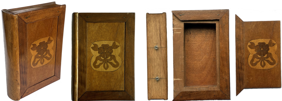
Figure 7. A simple puzzle book with inlays, probably made by an amateur

The first is a puzzle book that, as a puzzle, resembles the Sri Lanka puzzles, in that the front of the book slides off. It has a nice inlay on the front, see Figure 7. This book, however, is not professionally made. It is cut roughly and the way it is manufactured is amateuristic. Due to some design choices its solution is not immediately obvious, so it is still a nice sample. The origin is probably England. The puzzle has pocket book size (HDT 16×12×3.5 cm).