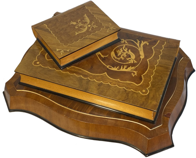
Figure 4 Small Hungarian puzzle book (left) and puzzle-book-stack (right)