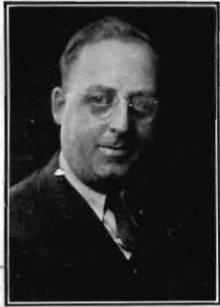
President of Wagner