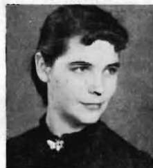
Cast In Shakespearean Role