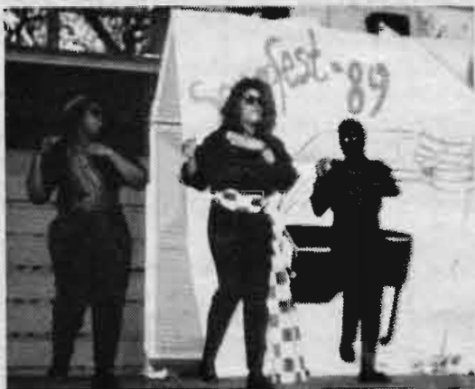
SIGMA PHI RHO RHOSSES