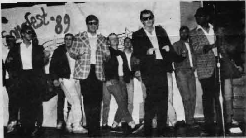
THETA CHI FIRST PLACE MEN'S CLASS B