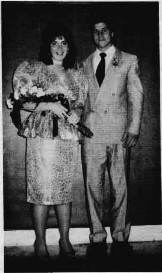
SECOND PRINCESS FRANNIE AND PRINCE PETE