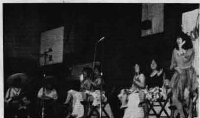
EPSILON DELTA OMICRON SECOND PLACE WOMEN'S CLASS B