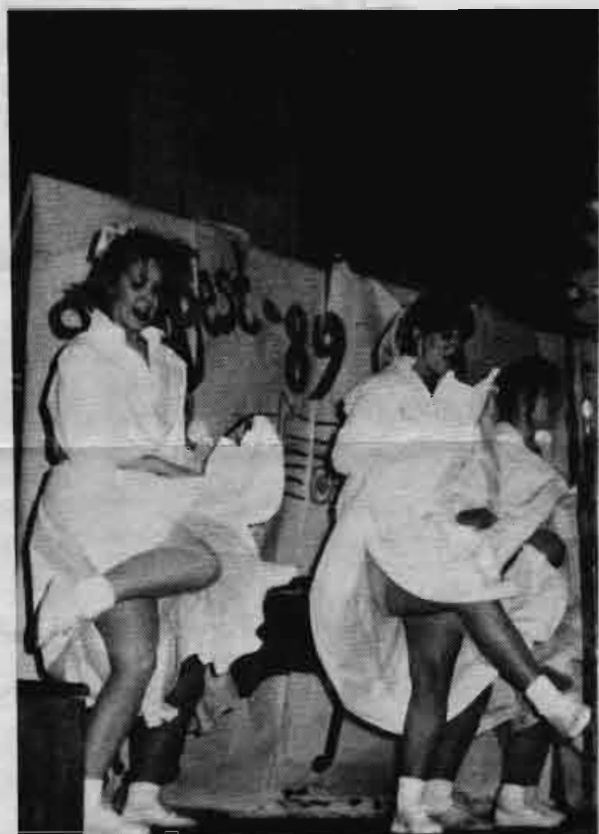
ALPHA DELTA PI THIRD PLACE WOMEN'S CLASS B