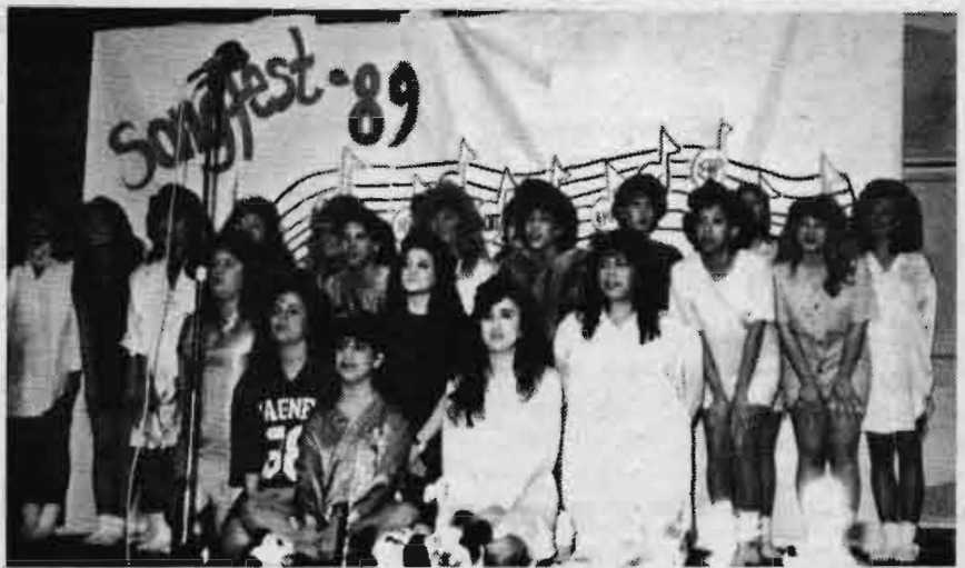
ALPHA OMICRON PI FIRST PLACE WOMEN'S CLASS B