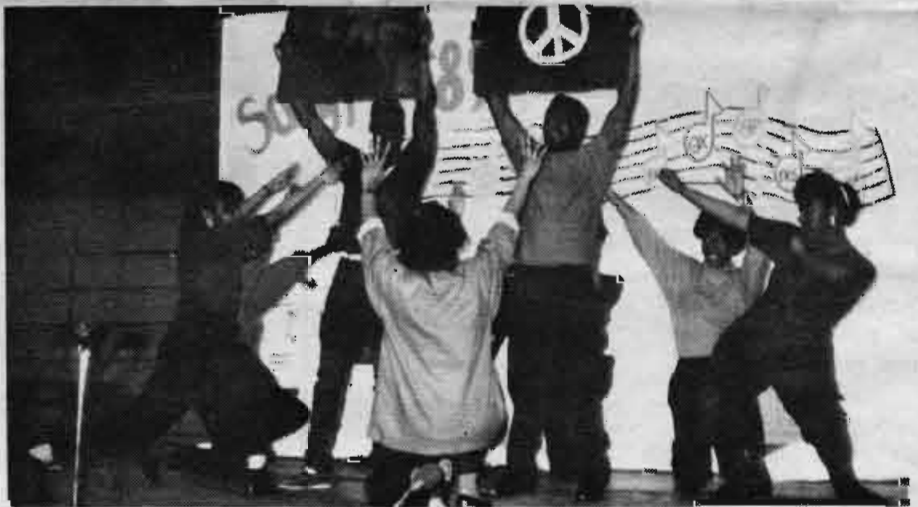
BLACK CONCERN FIRST PLACE MIXED