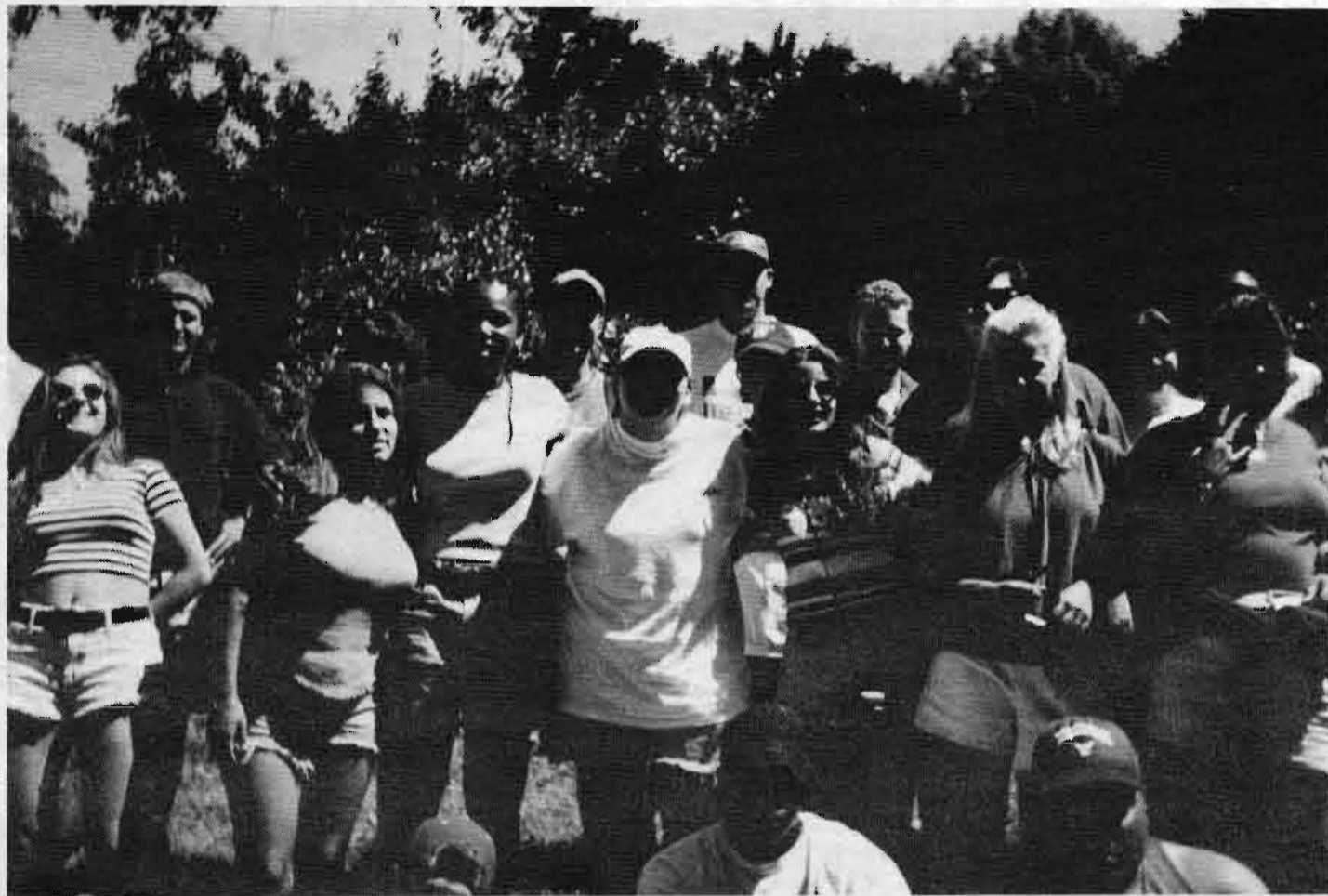
The Residence Life staff enjoys a retreat in Central Park