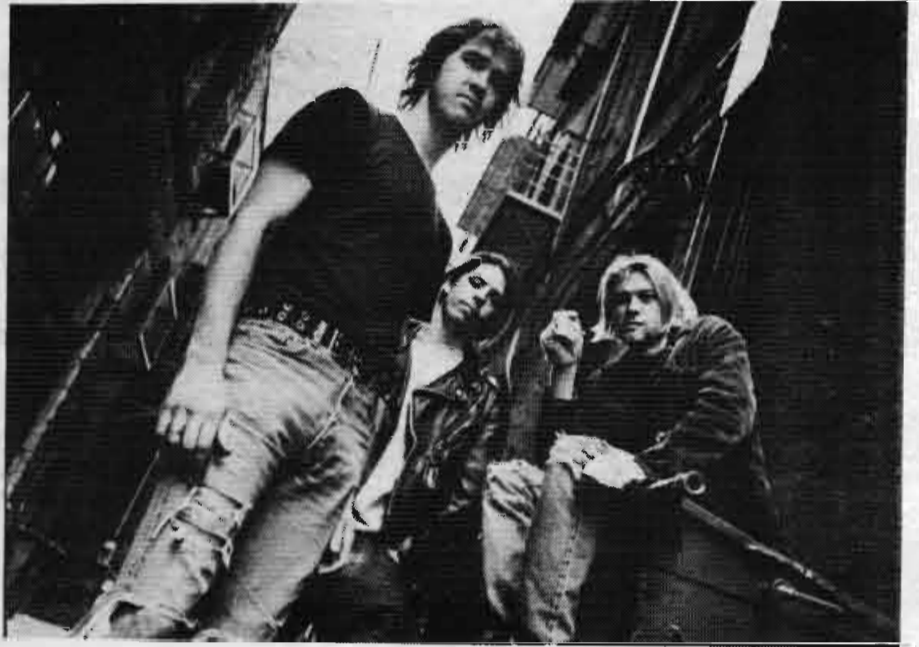
Nirvana: Chris Novoselic, David Grohl and the late Kurt Cobain