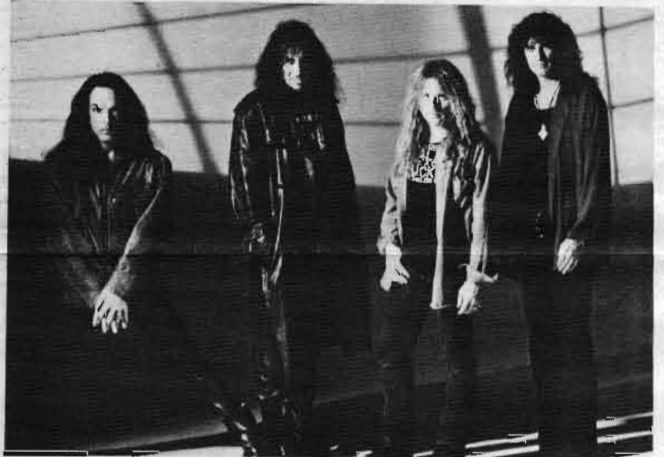
Kiss: Paul Stanley, Gene Simmons, Eric Singer, Bruce Kulick