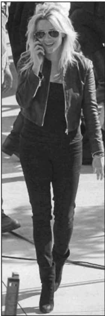
Reese Witherspoon: effortlessly put-together

Hollywood's sweetheart Reese Witherspoon wears a zipper-embellished moto jacket, aviators and black boots on the L.A. set of her film This Means War .