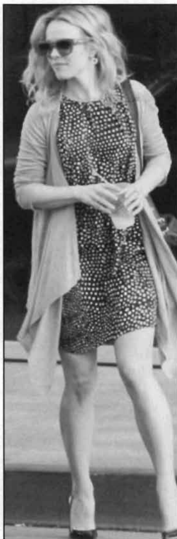
Rachel McAdams: a classic beauty

Star Rachel McAdams is often seen casually put together, her above look being a simple dress, throw-over sweater and patent leather shoes with a slight heel.