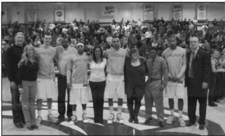
Seniors sport their pink sneakers with their families.

2/12 Rutgers University @ 2:00 Home 2/25 Providence College @ 1:00 Away 2/28 Lafayette College @ 7:00 Away 3/3 Saint Joseph's University @ 2:00 Home 3/13 Virginia Military Institute @ 3:00 Away 3/16 Mercer University @ 1:00 Away 3/24 University of Hartford @ 2:00 Away 3/31 Robert Morris University @ 1:00 Home 4/3 Manhattan College @ 7:00 Home 4/7 Quinnipiac University @ 1:00 Away 4/14 Sacred Heart University @ 1:00 Home 4/22 Bryant University @ 1:00 Away 4/28 Mount Saint Mary's University @ 1:00 Home