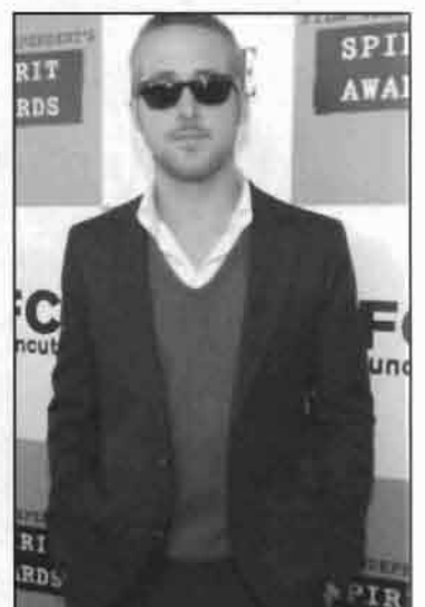
Ryan Gosling: masculine chic

Finish the look off with Echo's black patent pump for $40 at DSW