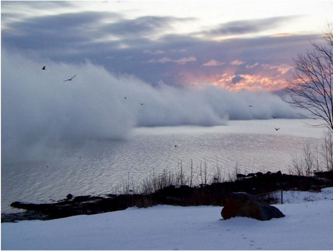
2nd Place (overall): Top of the Morning by Kimberly Snyder Sterrs