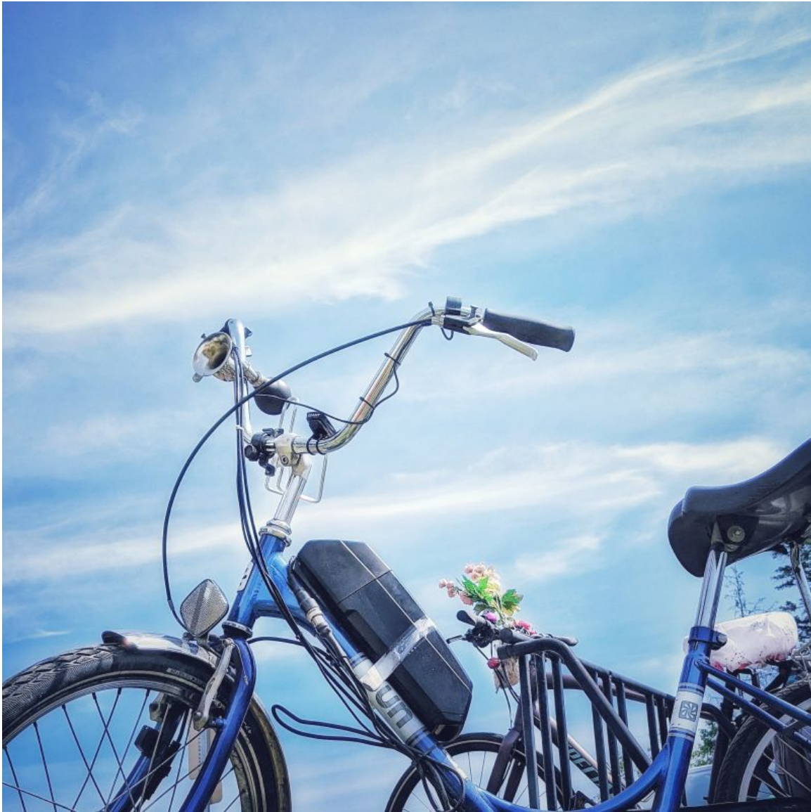
3rd Place (overall): Bike Rack, Belfast Soup Kitchen by Turil Cronburg

The ABCD project and the Belfast Free Library invite you to submit photos of your favorite Belfast-area places... and your favorite ways to enjoy them!