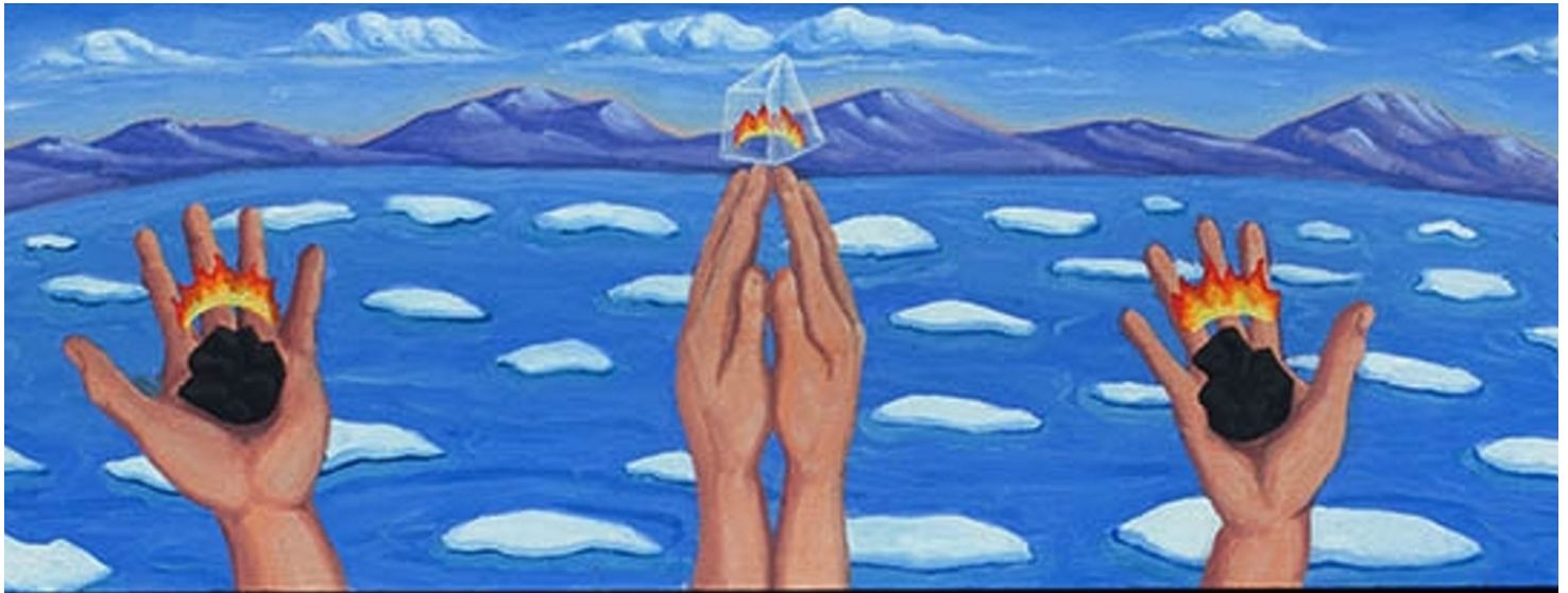
Detail from "Polar Ice", Janice Kasper, 2013, 12 x 55 in, oil board

ABCD & the Belfast Free Library and many other organizations in Belfast have lined up an inspiring series of events & activities during Earth Week 2022. Check out some of them below!