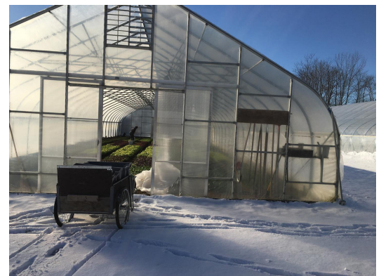
Winter solstice greens harvesting, Dec. 21, 2021

Go to www.belfastlibrary.org/abcd-events to get the Zoom link.