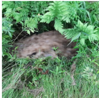
Torrential Rains Overwhelming Culverts and Storm Drains Aidan Webb, July 9, 2021