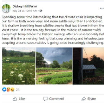
Climate Crisis Is Impacting Our Farm in Subtle, and Many, Ways Dickey Hill Farm, July 28, 2021