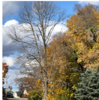
Trees of Belfast Fred Bowers, October 28, 2021