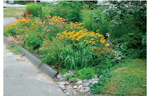
Residential rain garden in Leominster, Massachusetts.

Our second Community Climate Conversation event on October 18th, on the topic of “Creating Resilience to Big Storms and Flooding” , attracted an engaged audience of 40 citizens. Attendees were energized by brainstorming actions the community could take together - most particularly the idea of creating a rain garden in a public location in Belfast and using it as an educational model.