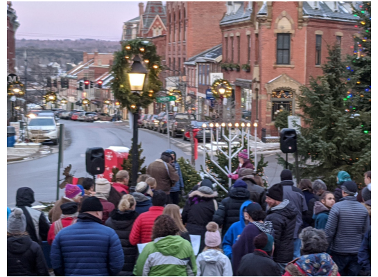
Belfast's menorah lighting and Christmas tree.

All of Belfast: Climate Dialogues, a project of the Belfast Free Library, invites you to share your personal story or reflection on making this holiday season more climate-friendly. What does "climate-friendly" mean to you, especially during this season? Are you considering changing anything about your gift-giving and holiday celebration habits? Perhaps more local buying, hand-made gifts, less online shipping? Have you found some favorite delicious Belfast-area food and beverages that everyone should try?