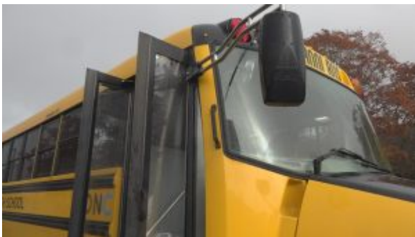
Through the Bipartisan Infrastructure Law, a $13.3M grant will help 13 Maine school districts buy 34 electric-vehicle school buses this year. Searsport RSU 20 received an award for two EV school buses ($790,000).

A new group called "Walk & Roll Belfast" is also being created to help citizens band together to create more active transit in our community! SIGN UP to learn more - send your email address to walkandrollbelfast@gmail.com to be added to the email list!