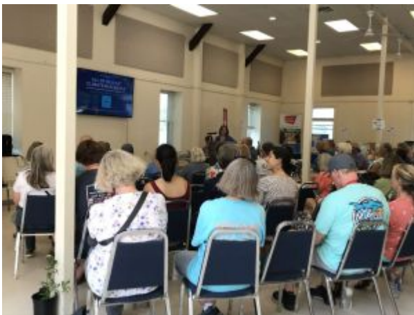
Belfast Bay Watershed Coalition's 'Sustainable Communities Day' June 1st, 2023

Climate Action Plan Delivered to City Council; Belfast Application for Community Resilience Partnership ~ June 2023 Newsletter