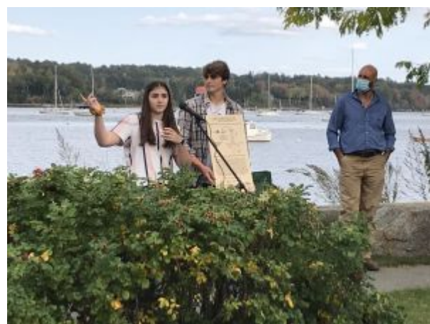
Belfast Area High School students describe their design and installation of a tidal gauge in Belfast Harbor, Maine in October 2021.