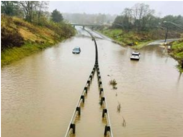
October 31, 2021 flooding of US Route 1, not far from the Belfast bridge over the Passagassawakeag River.

In this issue: You're invited to a Belfast Community Climate Conversation on October 18, to discuss how our community can best handle stormwater flooding & drought.