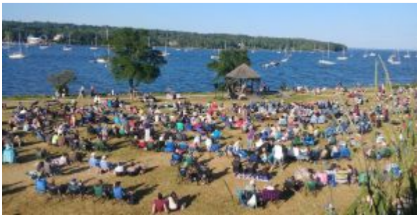
Belfast Summer Nights music, July 7, 2022