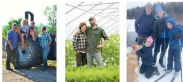
Shown left to right: Bahner Farm, Dickey Hill Farm, Daisychain Farm

Climate Change Impacts Forests & How Forests Slow Climate Change", and give your input to the Belfast Climate Action Plan!