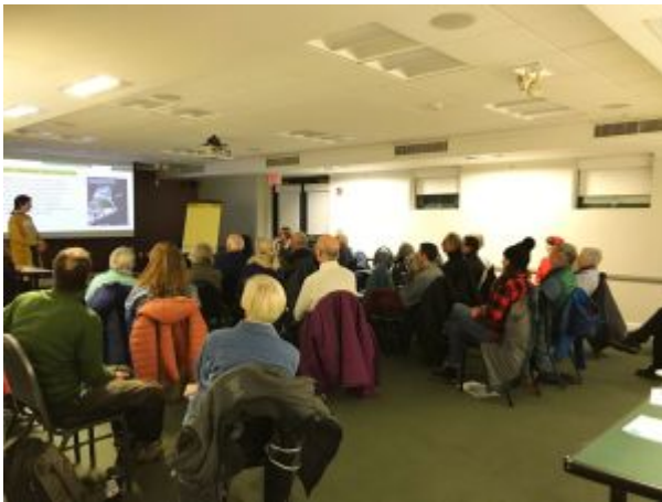
A great turnout and engaged audience at ABCD event on February 9, 2023, "The Future of Transportation in Belfast and Waldo County"

Transportation" conversation; upcoming events including Community Composting.