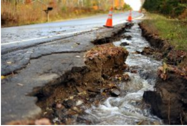
October 31, 2021 stormwater erosion on Pours Mills Road, Belfast.

discuss how our community can modernize our homes & buildings for energy efficiency and reducing greenhouse gases.