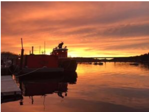
"This sunset photo of the tugboats was taken from the Nautilus patio after a big band of thunderstorms

CALL for the ABCD Photo Contest (deadline July 15th)! We also reflect on last week's Supreme Court decision limiting the EPA's authority; and share hopeful notes from Maine's June 17 " Communities Leading on Climate " conference .