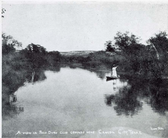
Palo Duro Lake—4 Miles from Canyon City