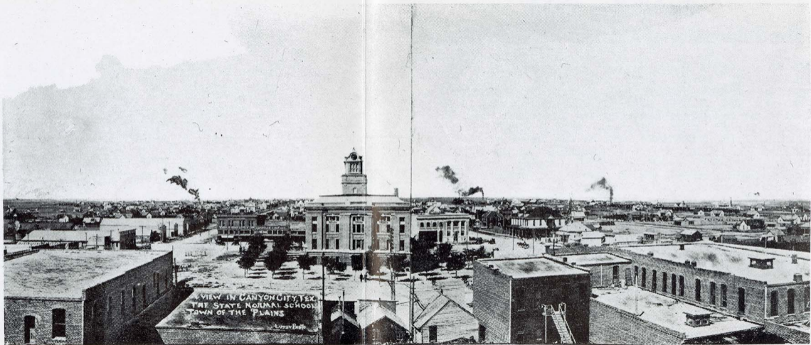
Birds Eye View of Canyon City