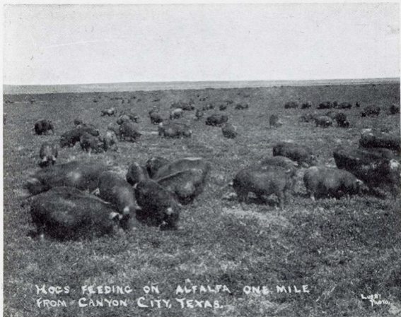
Twelve Hundred Hogs on Word's Hog Ranch