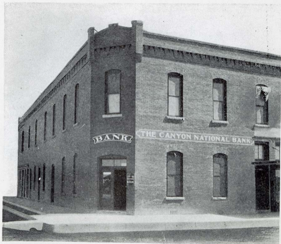
The Canyon National Bank