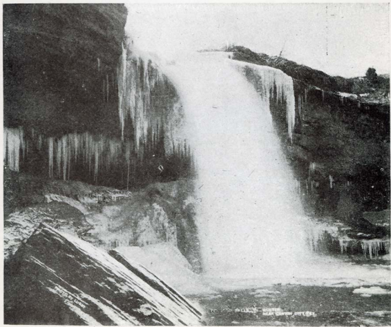
Dreamland Falls in Winter. Palo Duro Canyon near Canyon City