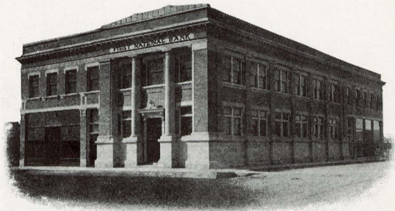
First National Bank