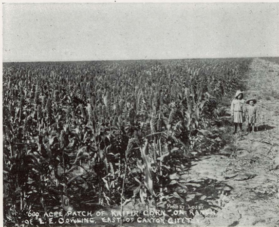
A Bank Account on a Randall County Farm