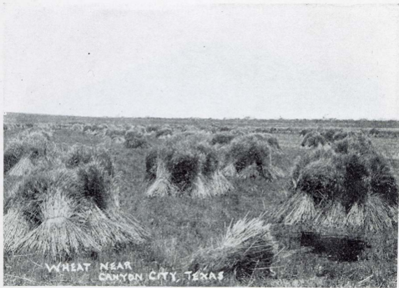
Ideal Wheat Scene— 37\frac{1}{2} Bushels Per Acre