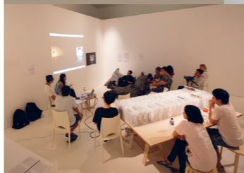
> Block 43, The Lab > Block 37, Residencies Interior