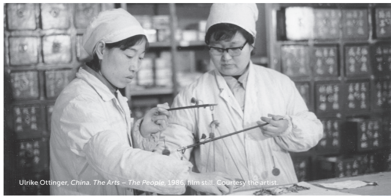
Ulrike Ottinger, China. The Arts - The People , 1986, film still.