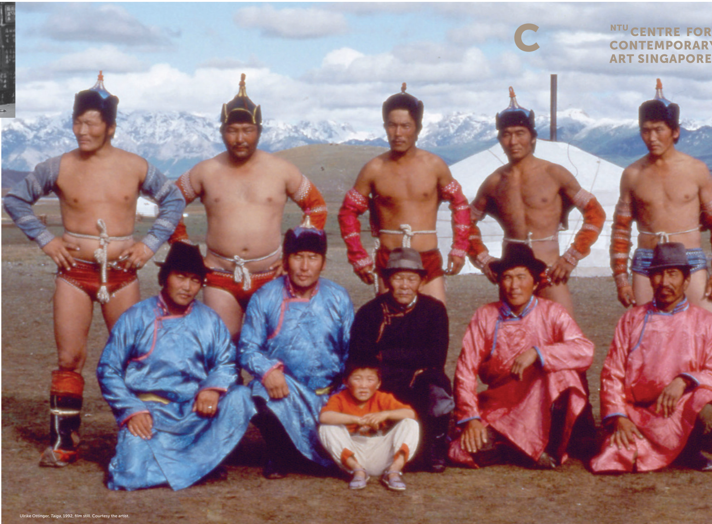
Ulrike Ottinger, Taiga, 1992, film still.