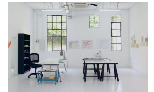
> Block 37, Residencies Interior