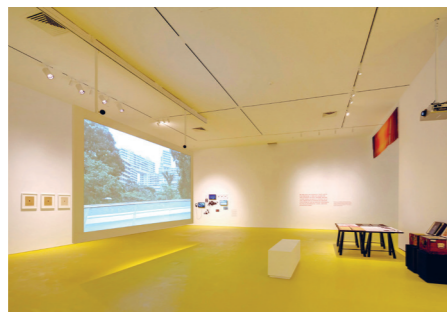
> The Making of an Institution , installation view. Courtesy NTU CCA Singapore

EXHIBITIONS, RESIDENCIES, RESEARCH AND ACADEMIC EDUCATION – bringing to a close the overarching curatorial narrative Place.Labour.Capital , that served as a framework for its activities since 2013.