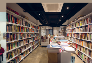
> Block 6, Library

Taxpayers to Singapore enjoy a 250% tax deduction in 2017. Visit ntu.ccasingapore.org/support or giving.sg for more information.