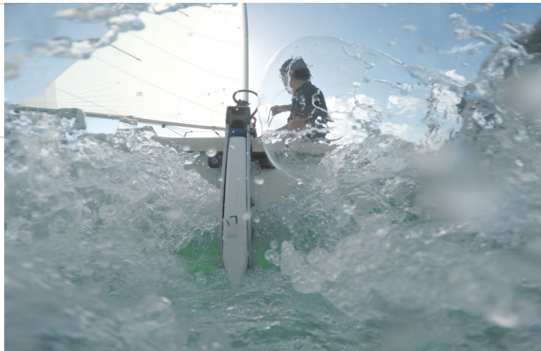
Charles Lim, SEA STATE 6: capsizes , 2015. Single-channel HD digital video, c.7min.