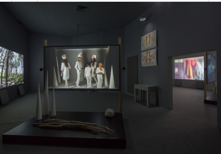
Installation view: Joan Jonas, They Come to Us without a Word, NTU Centre for Contemporary Art Singapore, 22 January – 3 April 2016.