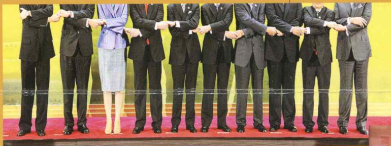
1. UP IN ARMS (2015) PRODUCED BY A CRAFT INITIATIVE

visual referent. The installation is the result of the artist Gary Ross Pastrana engaging DSM Solutions to prototype props that could stand in for Southeast Asian artworks. In this manner, the artist has effectively outsourced the sometimes-problematic task of representing Southeast Asia, an implied obligation of artists invited to regionally themed group exhibitions within the region.