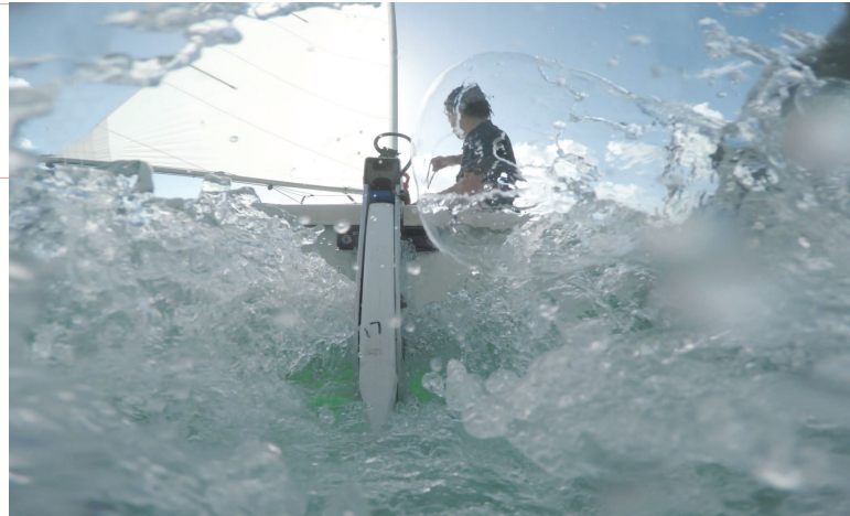
Charles Lim Yi Yong, SEA STATE 6: capsized (2015), digital film still.

Southeast Asia as a geographical region and conceptual category, is a contested entity. The possibilities and uncertainties in this region continue to pose unique social and political challenges. Conceived in extension to SEA STATE, The Geopolitical and the Biophysical: a structured conversation on Art and Southeast Asia in context, Part II will attempt to address the multiple notions of the "Southeast Asia" and the various issues surrounding its border, territories, dilemmas and anxieties.