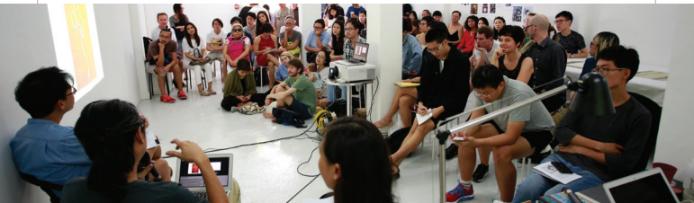
An Abstract, Speaking – A panel discussion by Artist-in-Residence Guo-Liang Tan at Art Day Out, 19 March 2016.

NTU CCA Singapore's Residencies programme is dedicated to facilitating knowledge and research for and by established and emerging artists from Singapore and abroad. It serves as a forum for cultural and artistic exchange in Southeast Asia, augmented with public events ranging from open studio sessions, lectures, live performances, and special projects in The Lab , NTU CCA Singapore's space for curatorial experimentation.