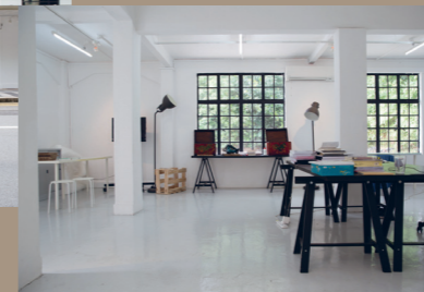
> Block 37, Residencies Interior