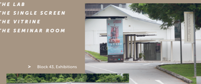
> Block 43, Exhibitions