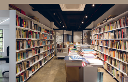
< Block 6, Library

Taxpayers to Singapore enjoy a 250% tax deduction in 2016. Visit ntu.ccasingapore.org/support or giving.sg for more information.