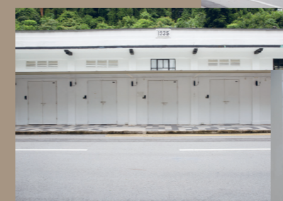
▲ Block 38, Residencies Studios