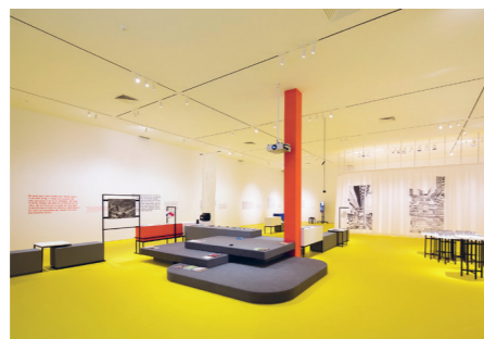
▲ Incomplete Urbanism: Attempts of Critical Spatial Practice , installation view.

The Exhibition Hall, Block 43 Malan Road Details overleaf