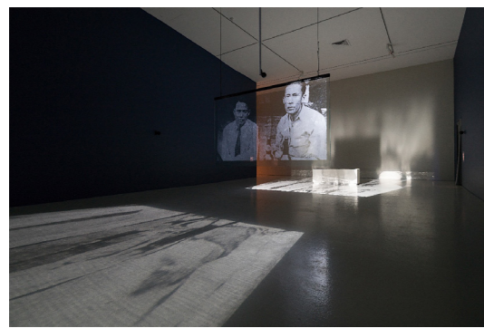
> Apichatpong Weerasethakul, Fireworks (Archives) , 2014, single-channel video installation, NTU CCA Singapore, installation view.

The Exhibition Hall and The Single Screen, Block 43 Malan Road Ghosts and Spectres – Shadows of History features video installations and films by APICHATPONG WEERASETHAKUL (Thailand), HO TZU NYEN (Singapore), NGUYEN TRINH THI (Vietnam), and PARK CHAN-KYONG (South Korea). The exhibition proposes a renewed understanding of the past to situate the present through vignettes of collective memory and personal experiences.