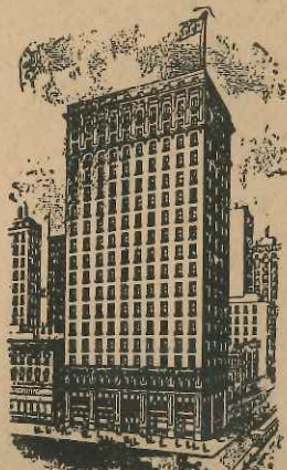
STEGER BUILDING Executive Offices and Display Rooms Chicago