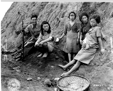
Photo taken by Charles H. Hatfield, of the U.S. 164th Signal Photo Company, 1944 - Songshan China