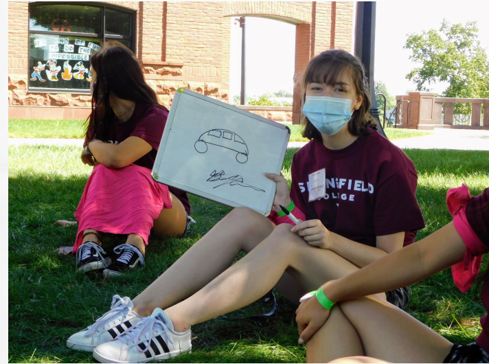
Photo of one of the activities we played during orientation.