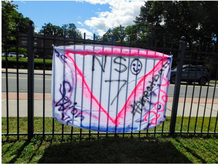
Photo of a banner we spray painted during orientation.