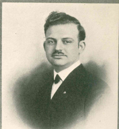
FRANCIS X. FORD