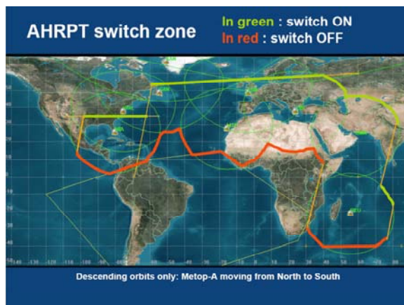
Figure SSSP-1. AHRPT switch zone for Metop-A.

There is currently a limited availability of Metop-A direct broadcast data due to an earlier failure of the Metop-A AHRPT side A. The root cause was heavy ion radiation, causing the failure of a component of the AHRPT Solid State Power Amplifier (SSPA). To minimize the risk of failure to the AHRPT-B unit, EUMETSAT has implemented a "partial" AHRPT service in those areas where the risk of damage from heavy ion radiation is reduced. For southbound passes, AHRPT side B will be activated for all orbits over the North Atlantic and European area, starting at around 60°N. The AHRPT will then be switched off before the spacecraft reaches the Southern Atlantic Anomaly region at around 10°N. The current switch zones are shown in the figure below.