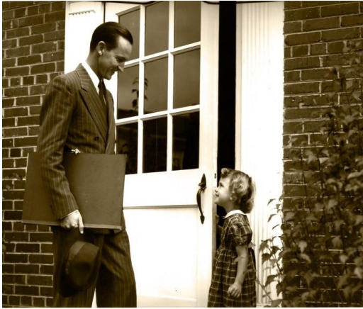
Census enumerator visiting a home in 1940.