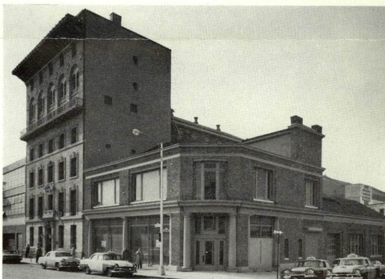
View showing the recently purchased property adjoining Charles Hall. Current plans call for razing of this building to erect a new, modern building.