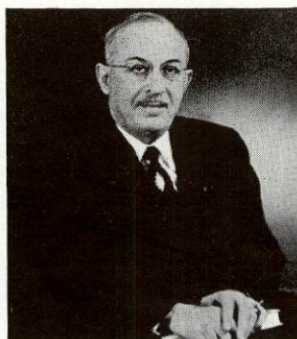
Judge Simon Sobeloff

Judge Simon E. Sobeloff, former Solicitor General of the United States, and former Chief Judge of the Maryland Court of Appeals, is now Chief Judge of the United States Court of Appeals for the Fourth Circuit.