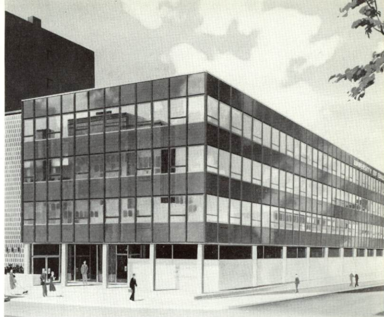
The architect's color rendering of the new building is on public view in Charles Hall.