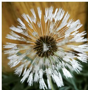
Dandelion photographed on my daily walk.

Why was I so scared and wanted to cry? Concern for my partner? He's a postman and has slight underlying problems.