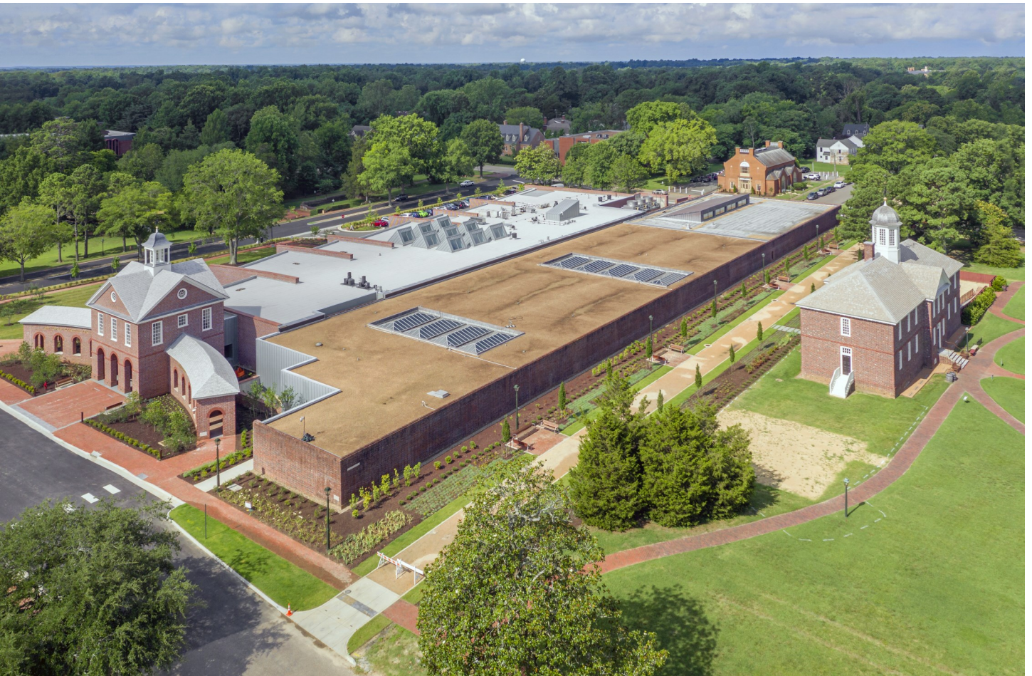
The expanded Art Museums of Colonial Williamsburg .