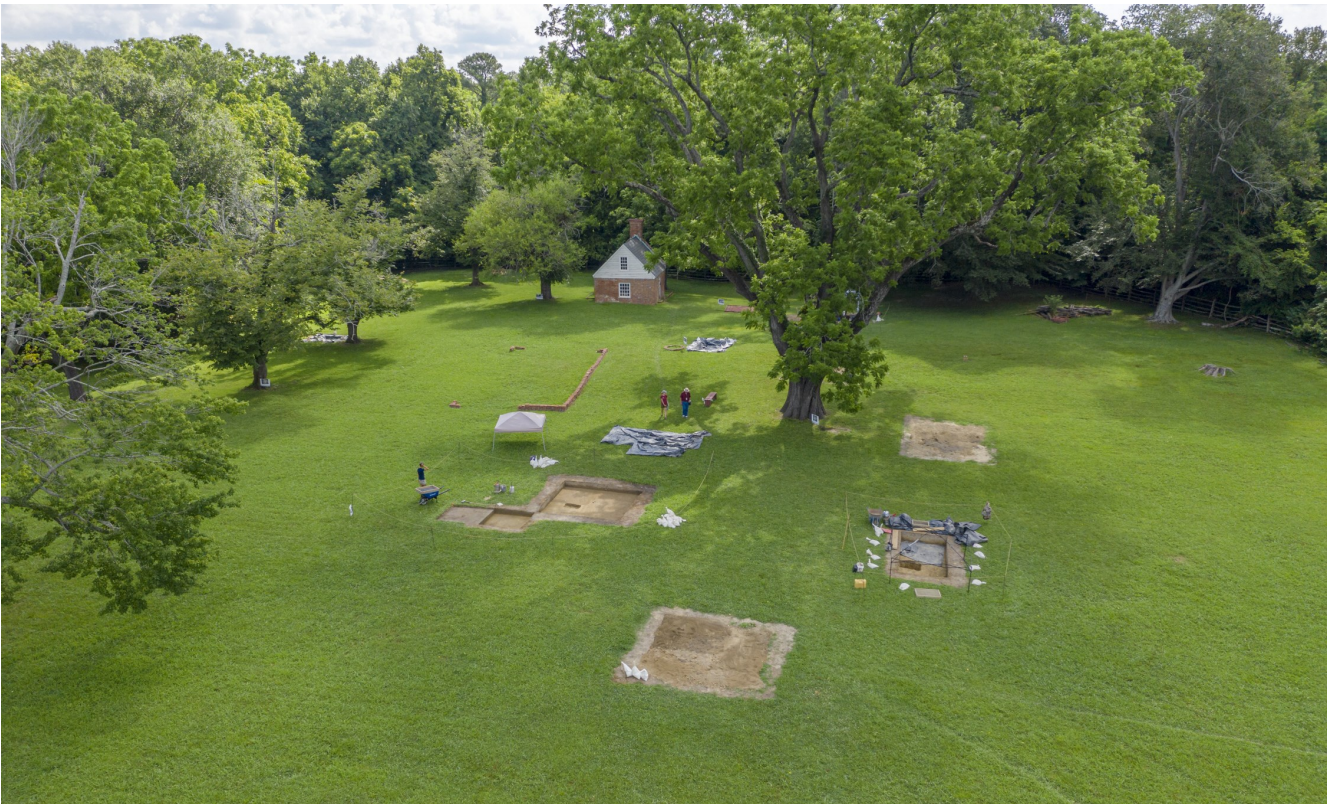
Custis Square archaeology project.