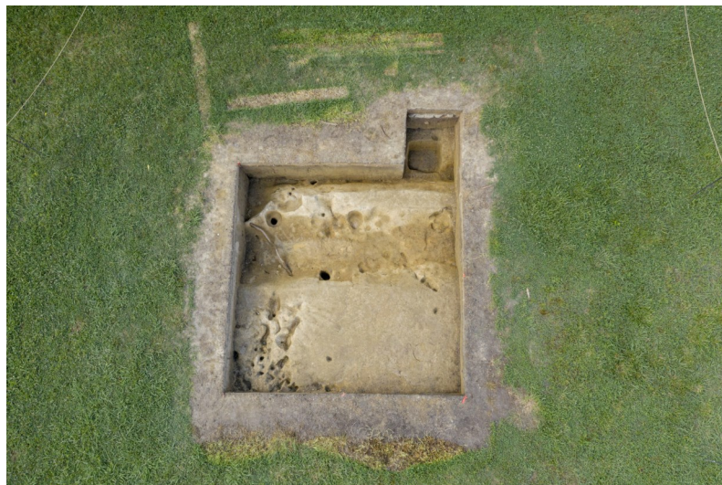
Custis Square ditch feature.