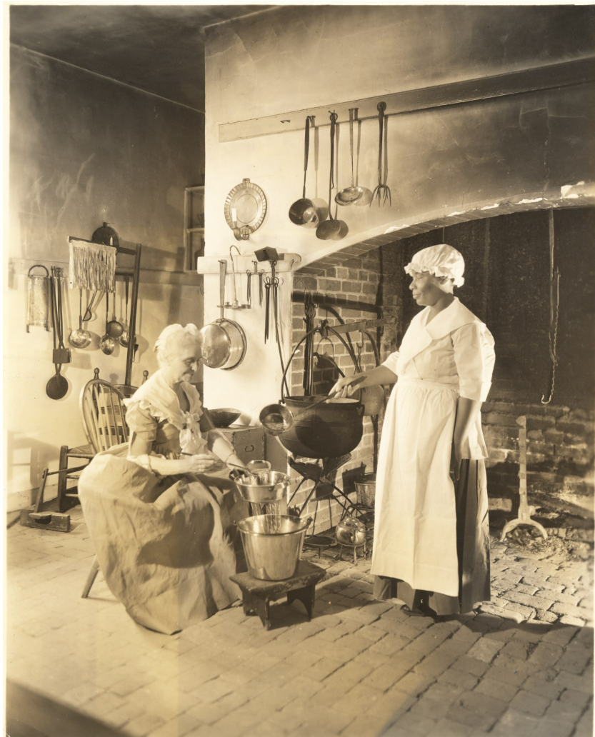
Two costumed employees salvaging fat in the Governor’s Palace Kitchen as part of a fat salvage drive, 1945.

Bruton Heights School, which had opened in September 1940 as a new educational facility and community center for Williamsburg’s African American residents supported in part by donations from the Rockefellers, expanded its recreational activities for adults to include African American soldiers. In 1941, groups of servicemen from Fort Eustis began attending movie screenings in the Bruton Heights School auditorium. A committee of African American citizens formed in 1943 developed a more formal recreational plan proposing that Bruton Heights School could function as a USO for African Americans stationed at Fort Eustis and Camp Peary. A dance held on March 24, 1943 in the Bruton Heights gymnasium attracted one hundred servicemen and gave impetus to the proposal. The offerings expanded to include a canteen serving light refreshments with help from community volunteers