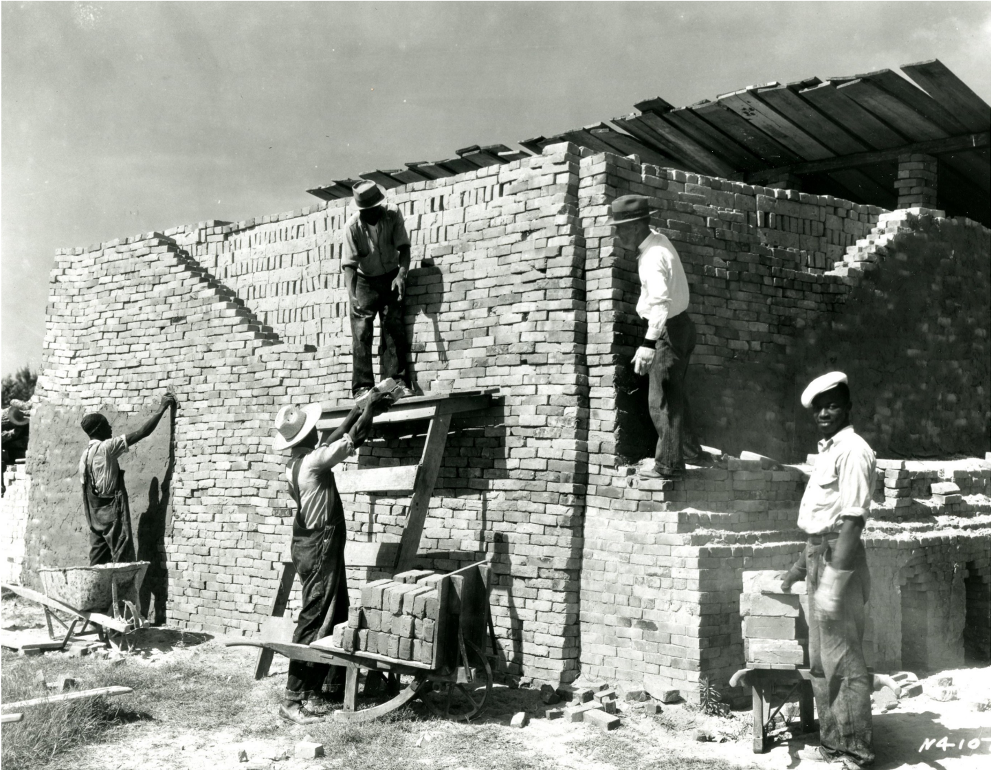
Workmen stacking bricks at the Todd and Brown Inc. brickyard located behind the Williamsburg Inn, 1930s .

and Hepburn in 1928 to oversee construction projects in Williamsburg, set up a temporary brickyard behind the Williamsburg Inn to facilitate the brick manufacturing process. Workmen from Colonial Brickyard Company staffed the site. Archival photographs in the library's collection capture the components of the early brickyard, including a clay pit, a clay mill, kilns for firing the bricks, and stacks of bricks drying in preparation for the firing. Rather than use the eighteenth-century foot treading process to mix and condition the clay for molding, the brickyard used the nineteenth-century technology of a pug mill powered by a mule circling round it. The pug mill contained blades within it that moved back and forth and mixed the clay as the animal's movement rotated a vertical shaft connected to them.