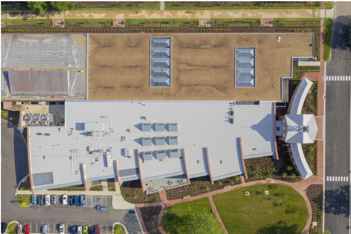
Over head view of expanded Art Museums of Colonial Williamsburg.