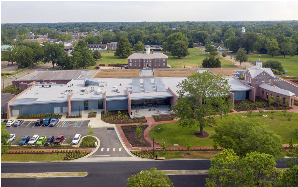
Southern view of the expanded Art Museums of Colonial Williamsburg.