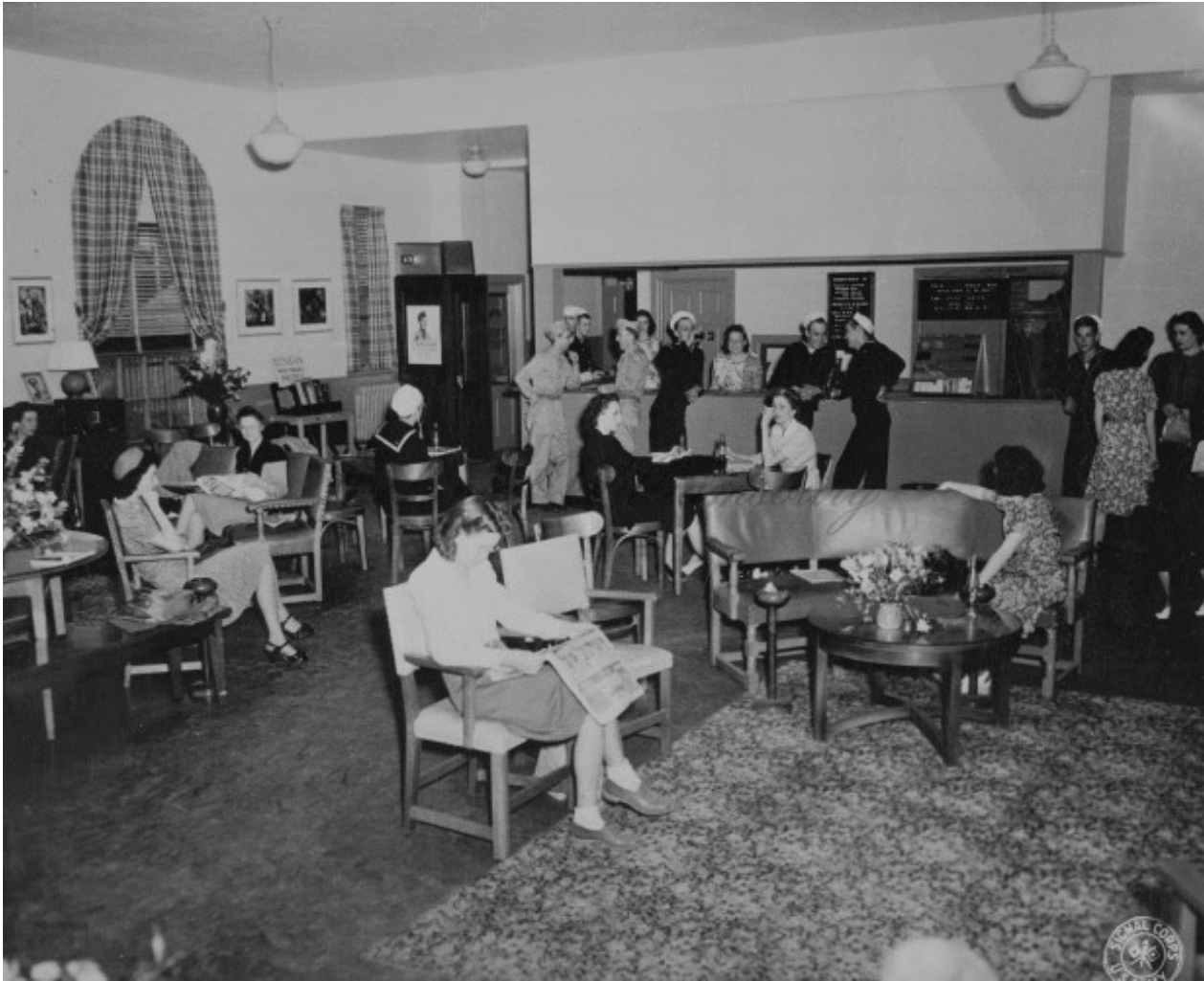
Soldiers and civilians socializing in the canteen of the Williamsburg USO, 1943

Through many different avenues of community wartime service, Colonial Williamsburg and its employees proved that they could indeed “Carry On” and impact the war effort in beneficial ways that would also sustain the organization financially. Through all these achievements, Colonial Williamsburg employees and residents alike were commended for their resourcefulness and commitment.