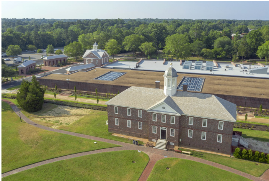
The expanded Art Museums of Colonial Williamsburg with Public Hospital in front.