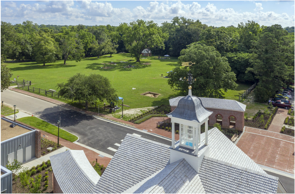
Custis Square as seen from the new entrance to the Art Museums of Colonial Williamsburg.