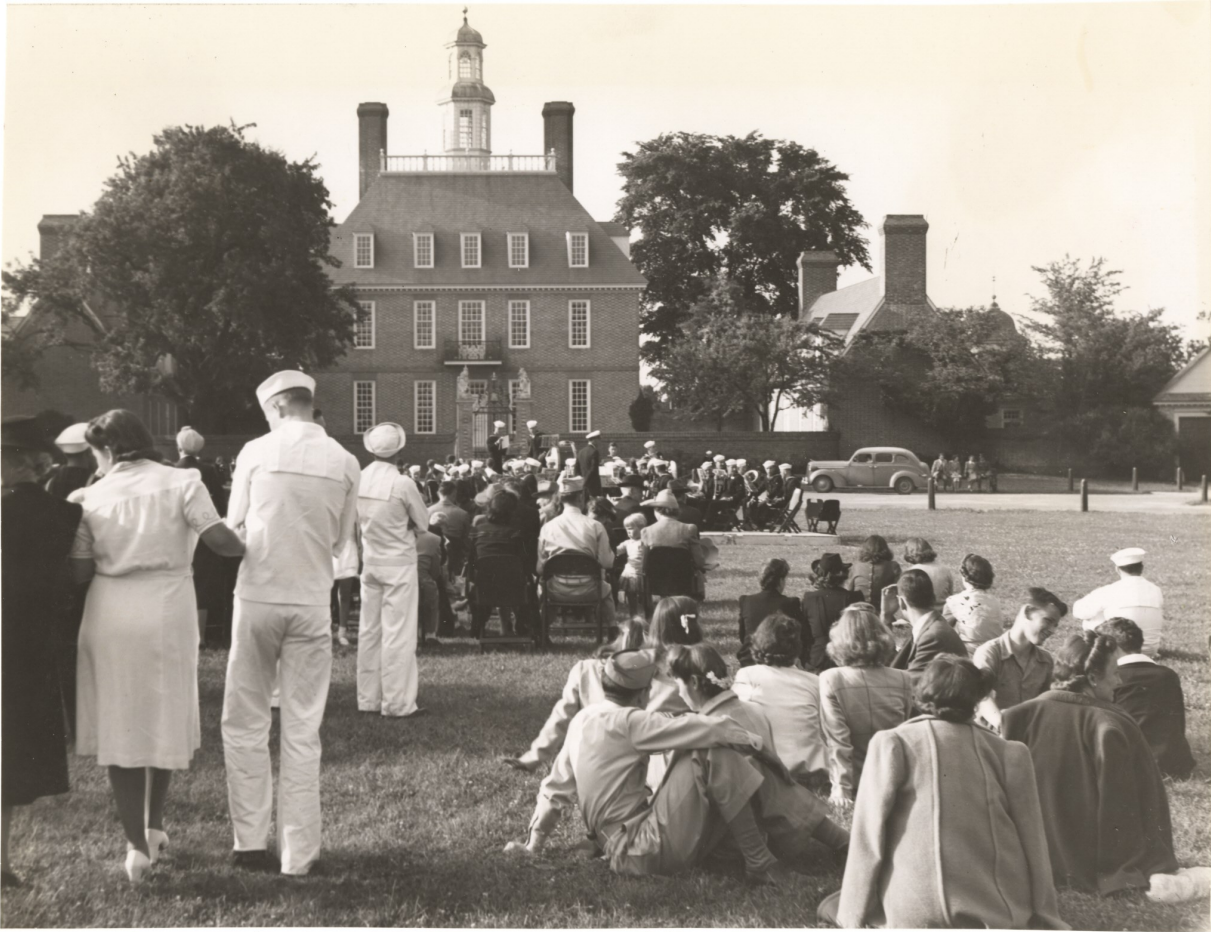
Soldiers and civilians listening to a Sunday band concert on Palace Green, 1943.