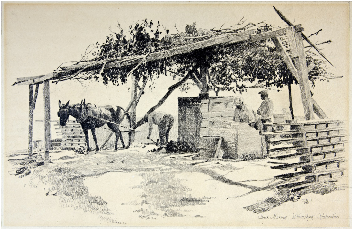
Colonial Brickyard Company workmen operating the pug mill at the Todd and Brown Inc. brickyard, 1933.