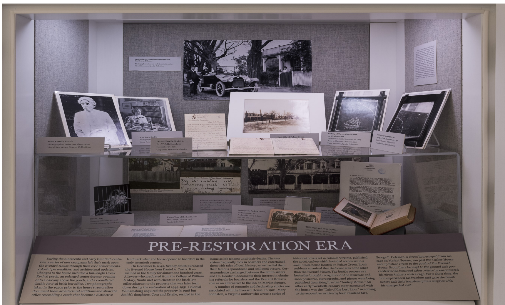
Items documenting the Everard House in the period before it was restored to its 18th-century appearance.