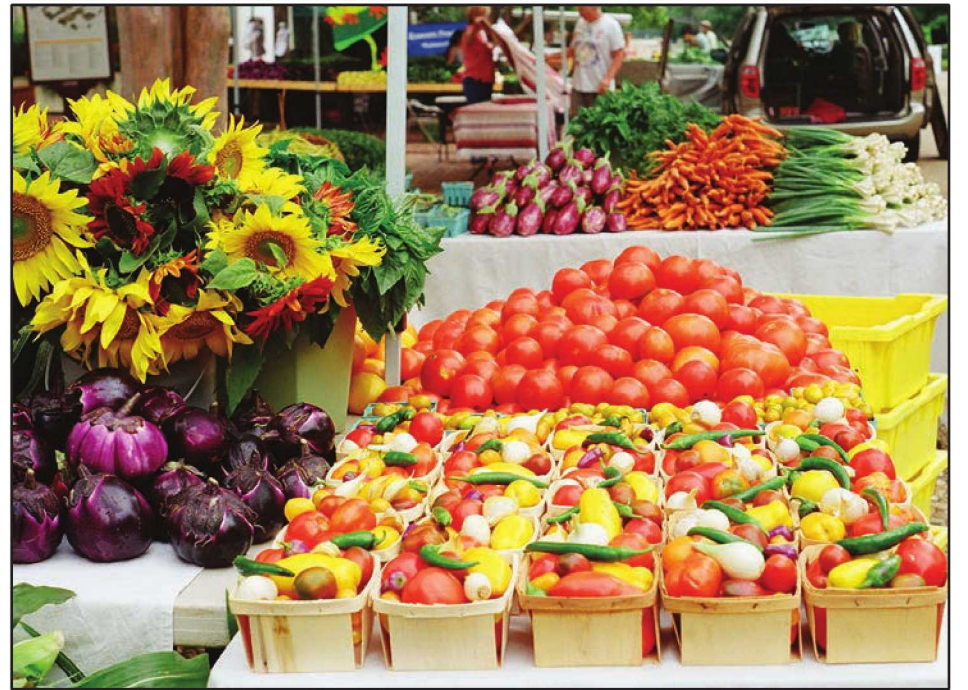
Merchants Square photo

For more information on Colonial Williamsburg or to make a reservation, please visit www.colonialwilliamsburg.com or call (800) 447-8679.