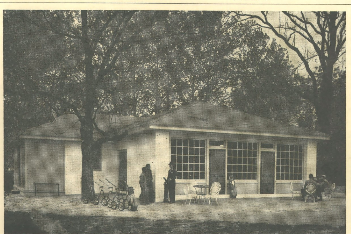
GOLFERS NEW GHQ, shiny as an unwrapped ball, now stands completed near the ninth green of the Inn course. Special features of the new golf house, a credit to C&M's John Hines and his construction crew, are locker spaces for 76 men and 25 women and storage racks for 200 sets of clubs. Beer, cold drinks, snacks and TV are offered in the attractively furnished clubroom. Course Pro Jimmy Weeks, proud as punch of his new castle, is shown at left talking with a couple of his caddies.