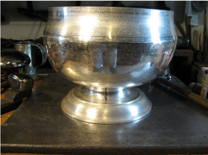
The Monteith and base, mostly planished