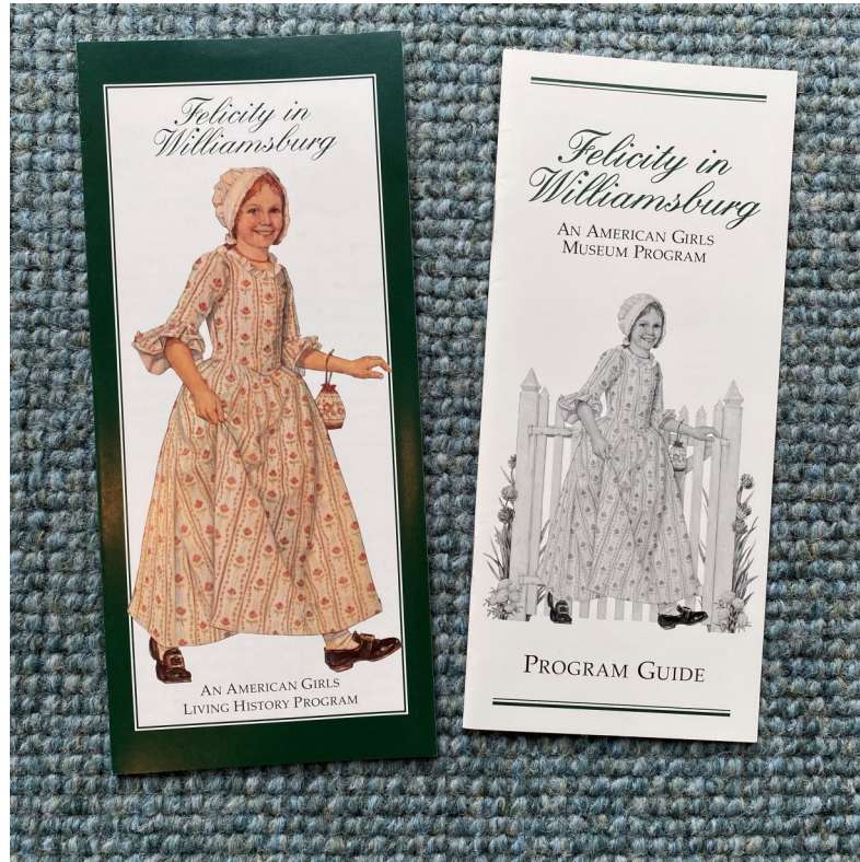
Felicity in Williamsburg program guides.