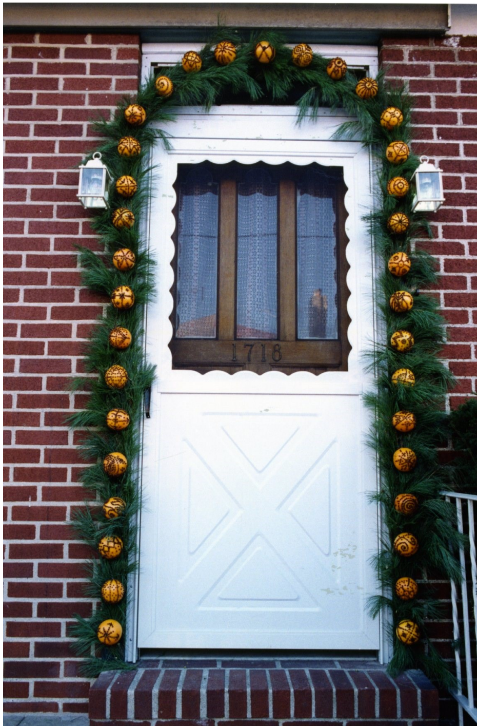
The door on a residence decorated in the Williamsburg style with a pine garland accented with clove studded oranges in neighborhood along West 11th Street in Brooklyn, NY.