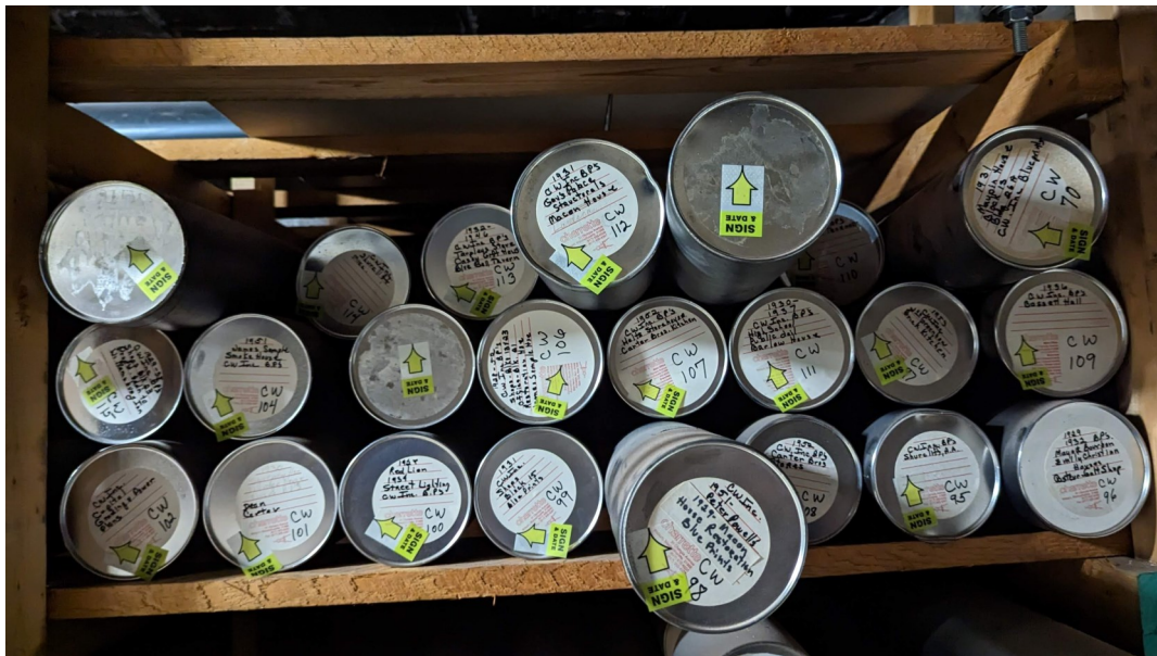
Tubes of rolled drawings relating to Colonial Williamsburg in situ in the attic storage area of Perry Dean Rogers Partners Architects.