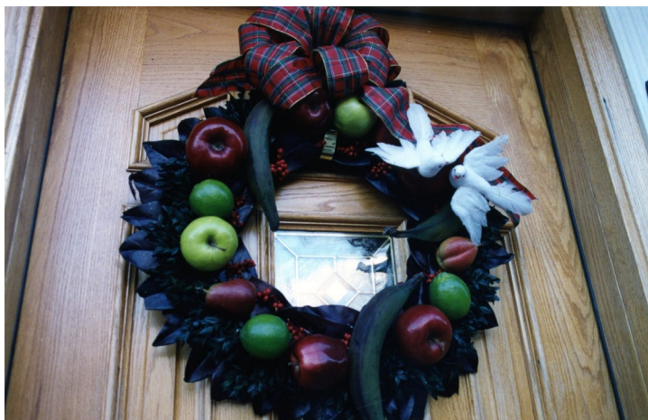
Door wreath decorated in the Williamsburg style with seed pods, apples, limes, magnolia leaves, berries, and doves in neighborhood along West 11th Street in Brooklyn, NY.