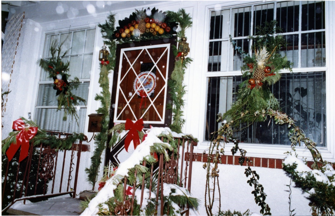
Residence with door decorated in the Williamsburg style with a fruit fan of apples, oranges, pomegranates, and a pineapple and windows decorated with accents made of pine branches, pineapples, and pomegranates in neighborhood along West 11th Street in Brooklyn, NY.