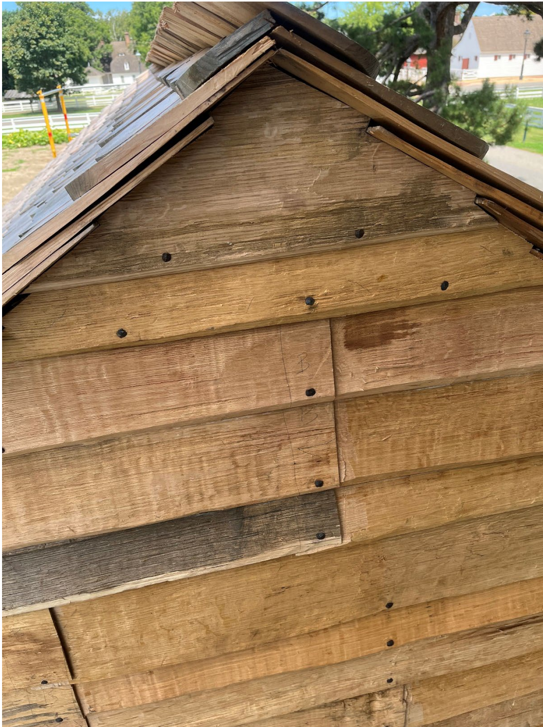
Clapboards installed on wagon shed.