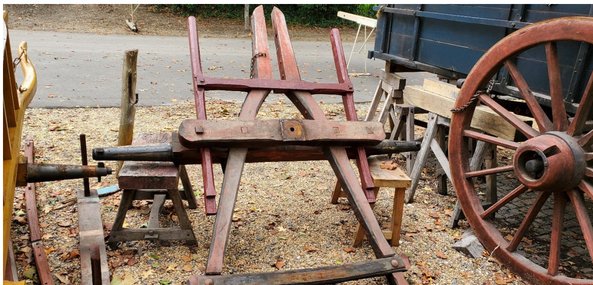
Below: A wagon fore-undercarriage assembly.

The Wheelwright is open Sunday through Friday.