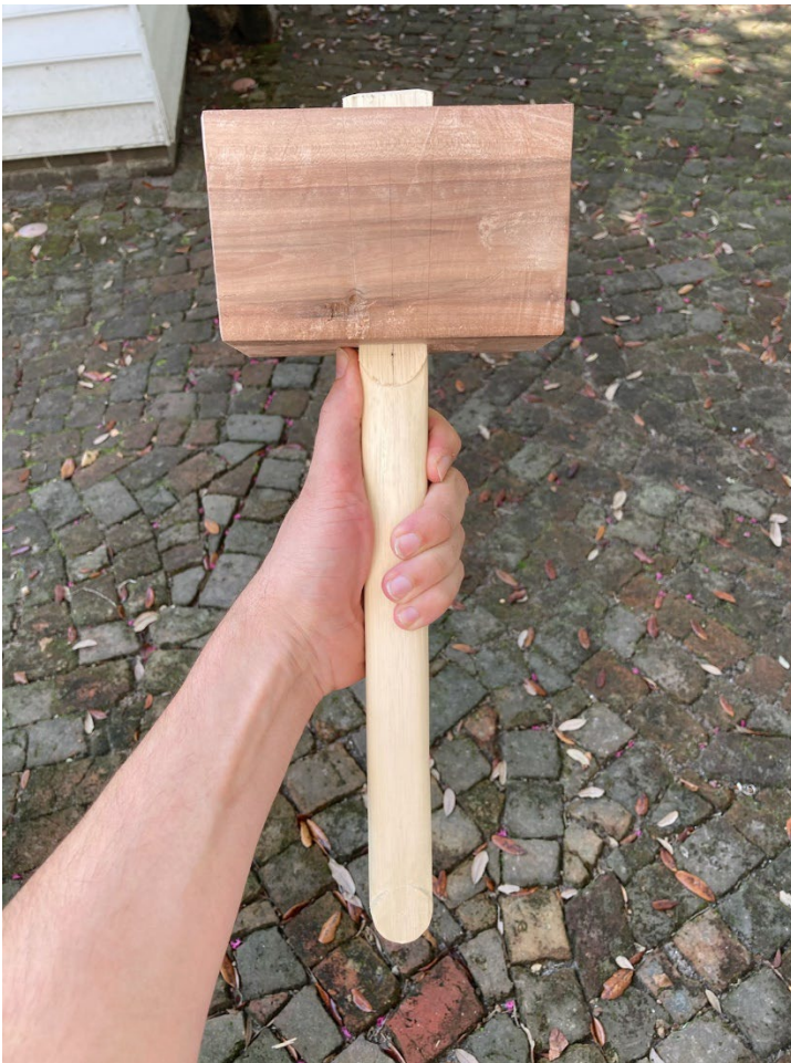
Peter's new dogwood mallet.

All hands have also been working on creating a set of over 40 cherry gift boxes for donors, to be presented in October with pieces produced by other Trade shops.