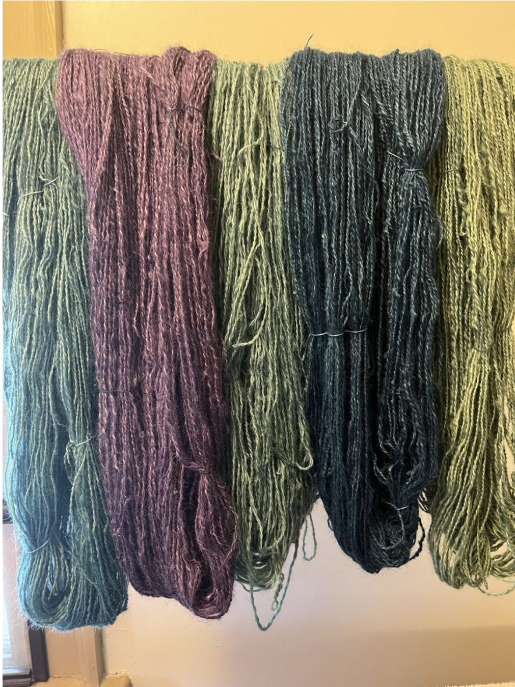
Handspun yarn dyed with indigo, logwood, and fustic

Weaver, Spinner, and Dyer – This past Tuesday was Dye Day! We spent the month leading up to the big day spinning as much yarn as we possibly could. We were able to put together ten skeins of our Leicester Longwool, and we cannot wait to see these go off to a good home. With indigo blue, logwood purple, cochineal red, and fustic yellow, our handspun yarn is now a veritable rainbow. If anyone ever has fabric in need of dyeing, please ensure the following: all fabric has finished hems, all fabric is labeled with your name and desired color, and all fabric is brought to us no less than one week prior to dye day.