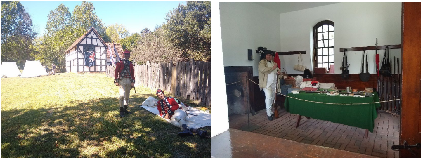
Left: "The 80th Regiment encamped, prior to Guest arrival, at the Frontier Culture Museum's "Global Tempest: A Revolutionary War Weekend." "

In tandem with our collaboration with the Frontier Culture Museum, Military Programs also completed its second Homeschool Group Workshop. We look forward to working with the Homeschool groups again in the Spring!