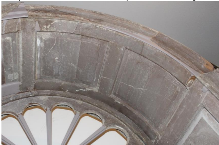
Menokin Portico showing the frame and panel construction