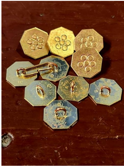
Chris' sleeve buttons in progress