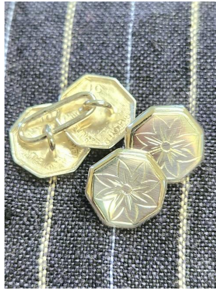
Bobbie's finished sleeve buttons