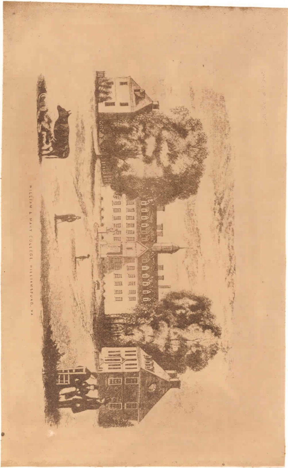
WILLIAM & MARY COLLEGE, WILLIAMSBURG, VA

(FROM BISHOP WILLIAM MEADE'S OLD CHURCHES, MINISTERS AND FAMILIES OF VIRGINIA Philadelphia: J. B. Lippincott Company, n.d. 1861, Vol. II, op. page 157.)