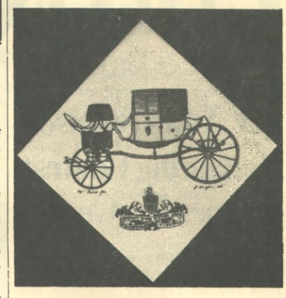
Wythe Chariot Tile

In this issue, the CW News is beginning a new monthly feature to illustrate and describe new developments in merchandising and to report on "best sellers" in the Craft House and hotel Gift Shops.