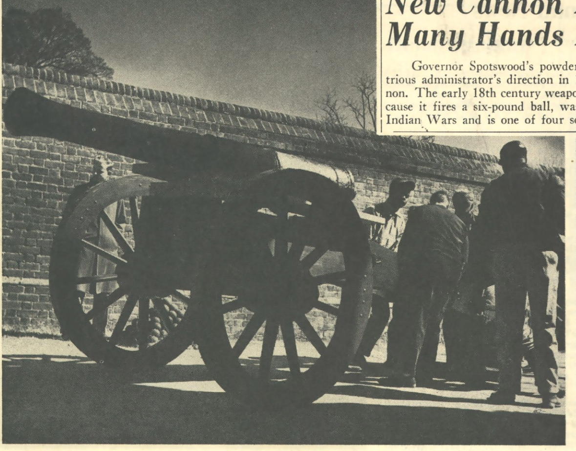
CANNON IS MOVED into place at the Powder Magazine. The six-pounder had a range of 2,500 yards and was principally a battering or siege gun. The barrel is blocked up in preparation for lowering it into normal position.

ways Bus Line tour directors to dependable employees. Williamsburg as part of their state guests for luncheon and a visit to the exhibition buildings.