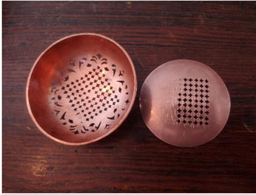
Parker's piercing practice