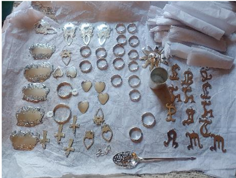
Recently completed pieces ready for sale