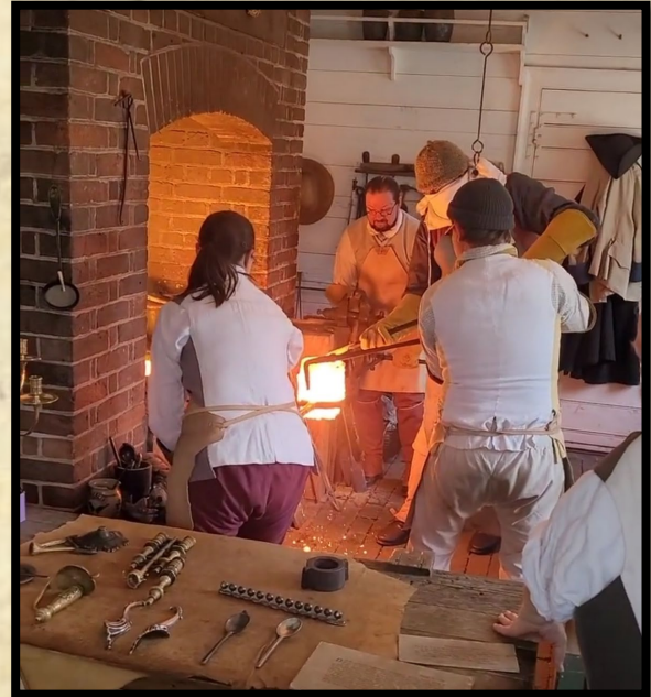
Sock Mandrel pour