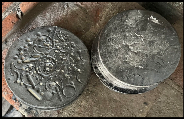
Lead cakes: used vs. fresh