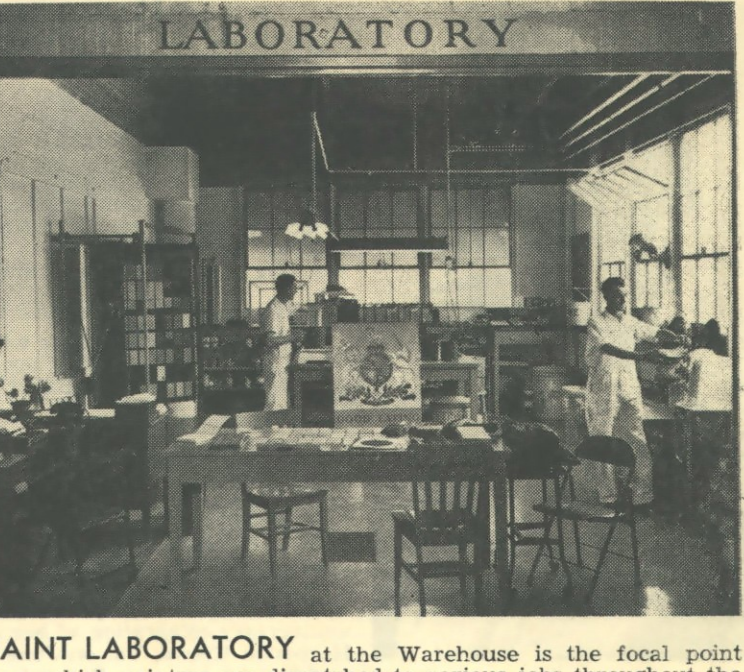
PAINT LABORATORY at the Warehouse is the focal point from which painters are dispatched to various jobs throughout the restored area. Here, records are kept and paints are mixed according to complex formulas.