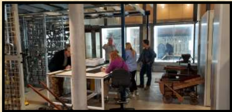
Studying objects in Scotland.