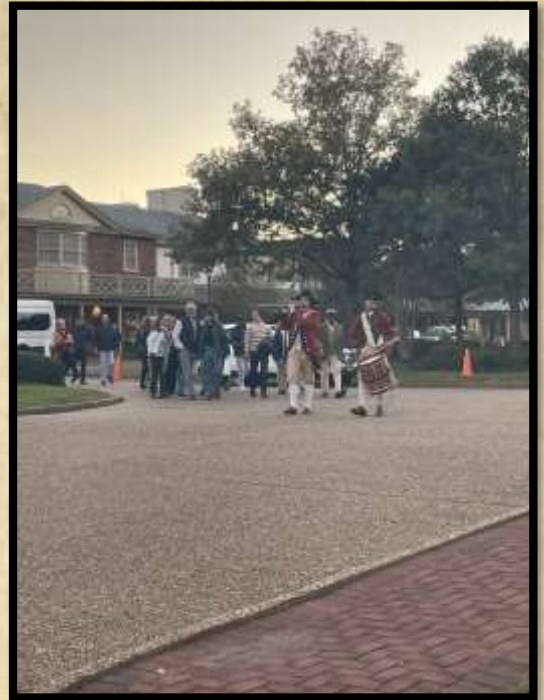
Seabolt and Green escort Audrain Motor Sports group from the Lodge to Shields Tavern