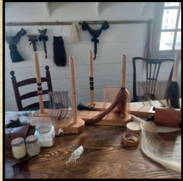
Benton's color blocked frame, Edith & Elias's color blend for display, Debbie's frame for Wilson.