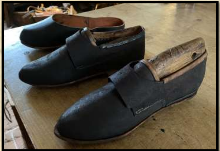
Nicole is halfway done with a pair of channel pumps and overshoes