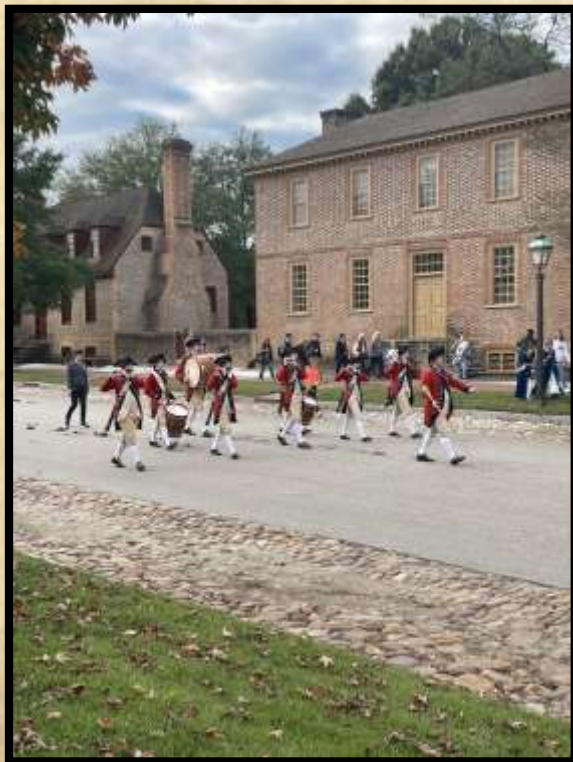
The Senior Corps marches down Duke of Gloucester Street after their afternoon performance