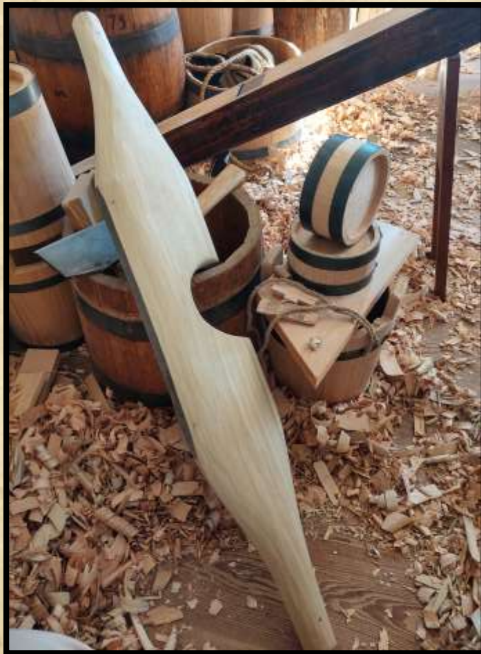
Shoulder yoke for carrying buckets.