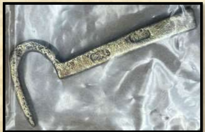
Photo of the same hook from Archaeological Collections.