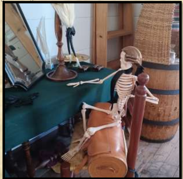
One of our most satisfied customers reflecting on life.