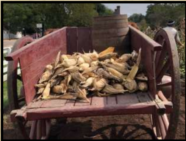
Gourdseed corn in ox cart.