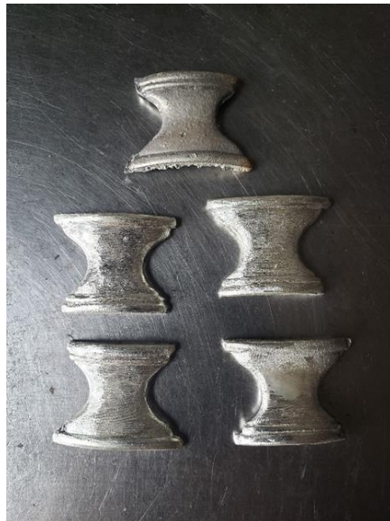
Tray feet in various stages of filing