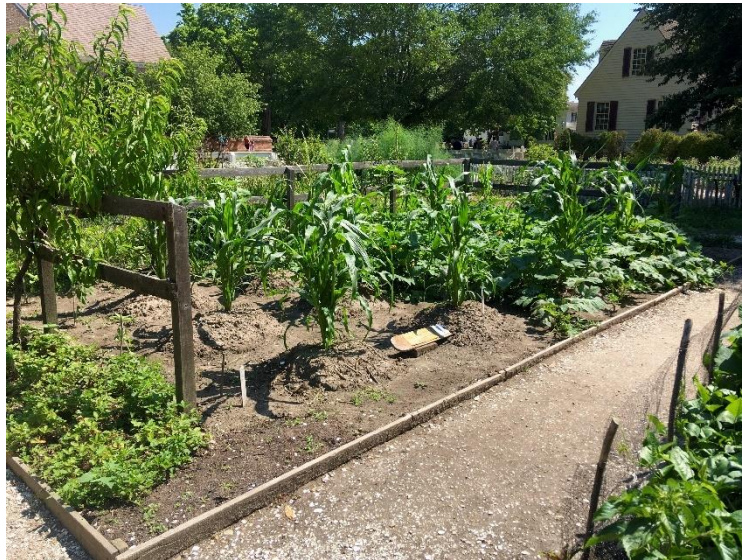
American Indian Garden