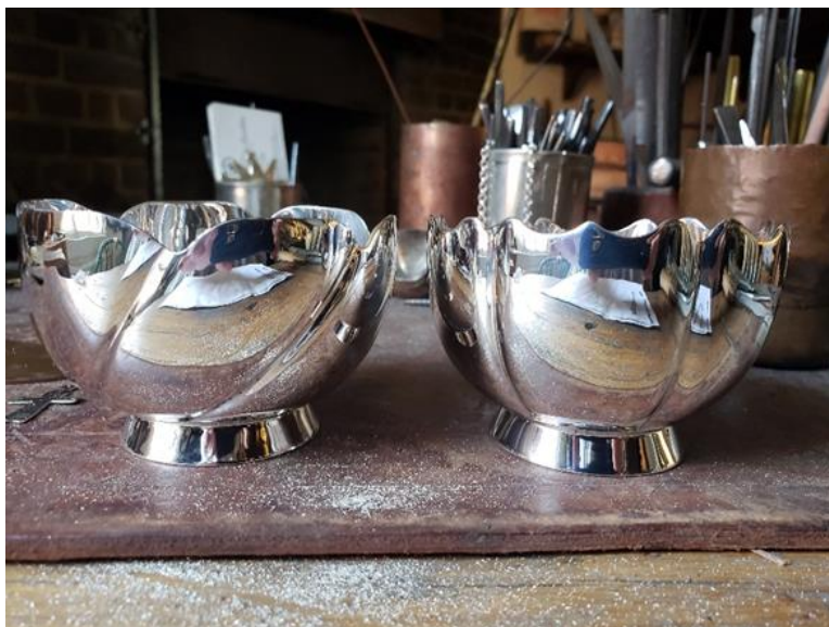
Preston's fluted bowls