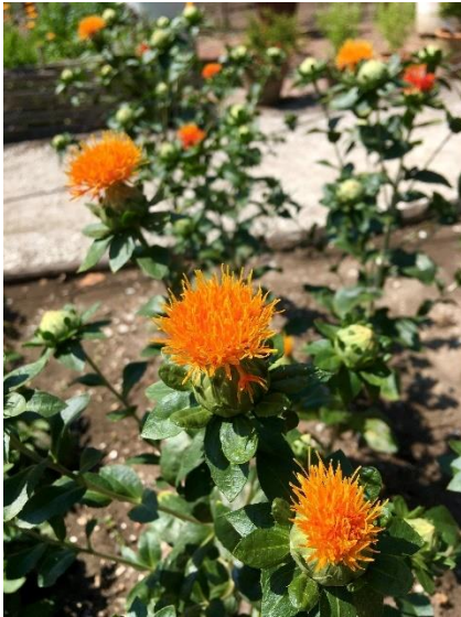
Safflower in boom at the Historic Garden