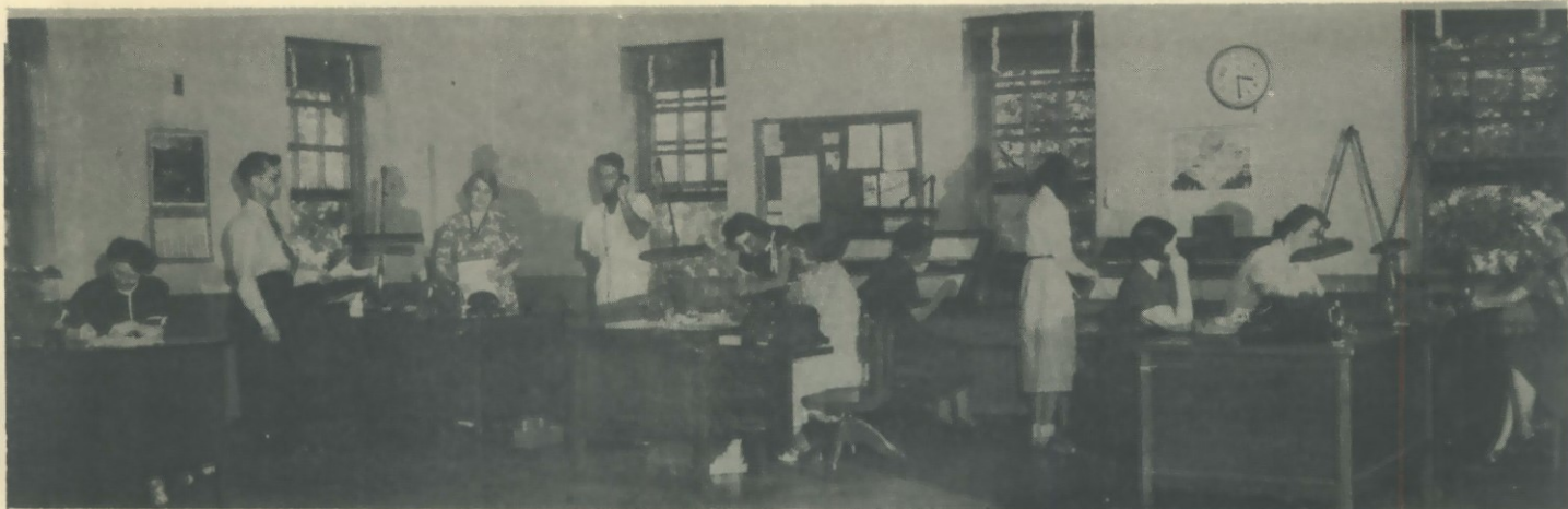
Reservation Office at the mid-afternoon rush period. (See story next page)