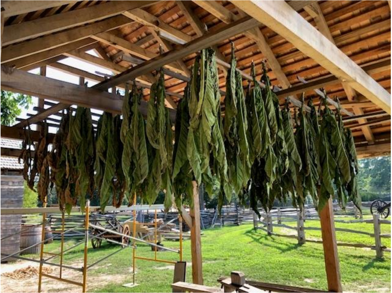
1 Tobacco curing at Ewing Field.

Farmer – Tobacco has been in the field for about three months and cutting began two weeks ago. I chose for six good leaves instead of ten based on the growth of the plant on this new soil. It has been hung in the new shed that the Carpenters are building.