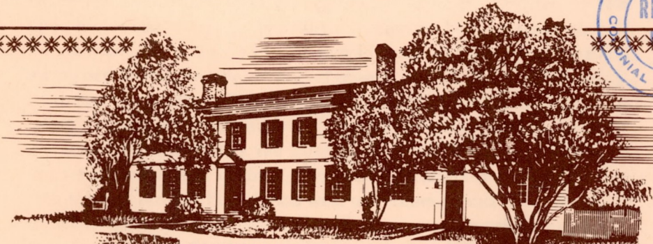
PEYTON RANDOLPH HOUSE