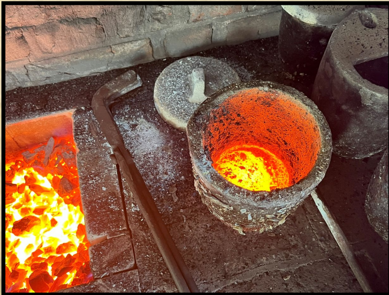
The forge and crucible after an iron pour.