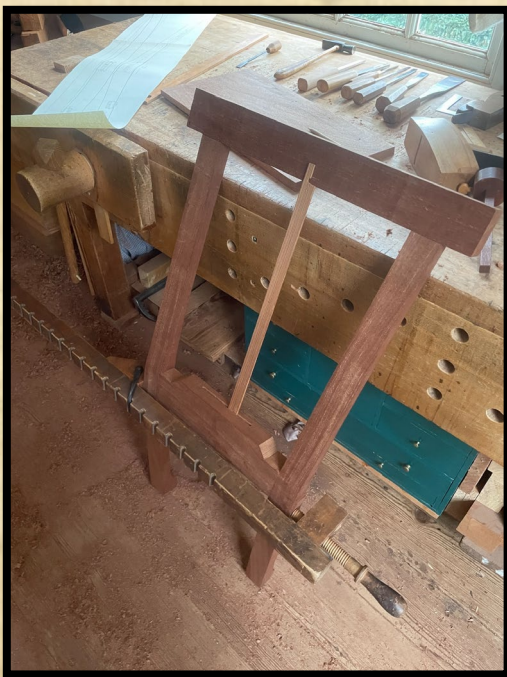
Mahogany chair starting to take shape