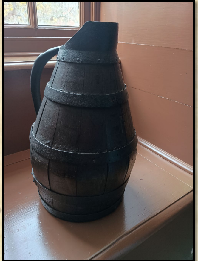
Wooden pitcher from the lumber room of the Everard House.