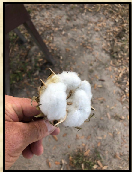
Cotton plant & Cotton ball