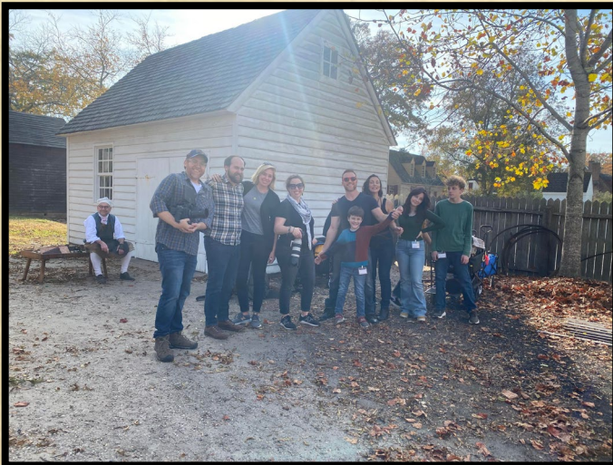
The cast and crew of the Vacation Channel shoot that the shop participated in.